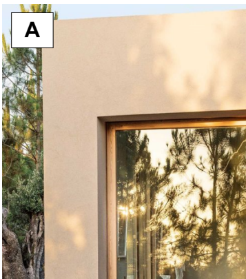
EARTHY TONES, RENDER EXTERNAL LIGHTWEIGHT WALLS & TIMBER FRAMED WINDOWS