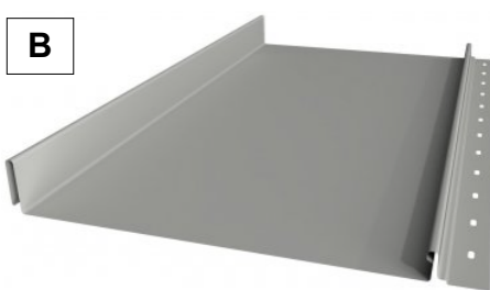
LIGHT GREY COLORBOND ROOF SHEETING