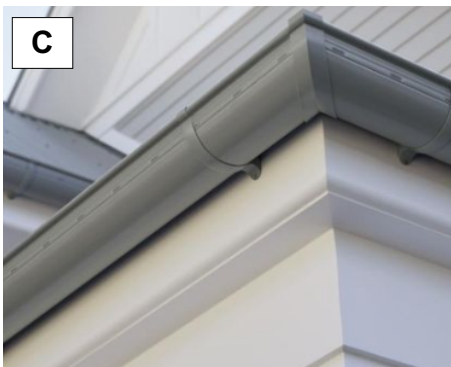
FACIAS, GUTTERS & DOWNPIPES COLORBOND MONUMENT