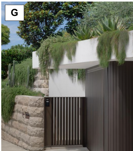
SAMPLE GREEN ROOF