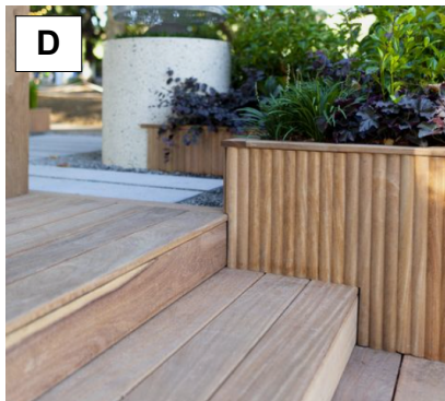
TIMBER STEPS & DECKING