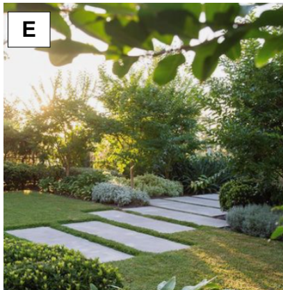
LANDSCAPE & PAVERS