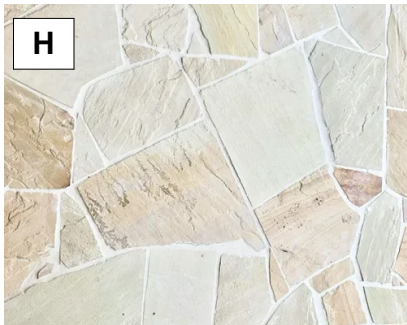
GARAGE & RETAINING WALLS