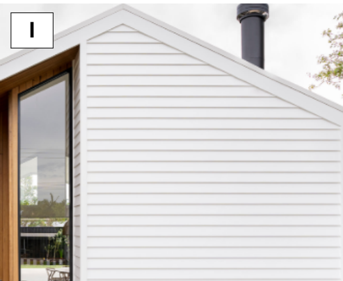
EXTERNAL LIGHTWEIGHT WALLS & WHITE CLADDING