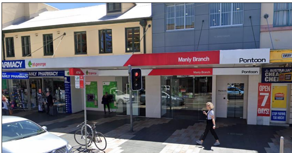
Photo 1 Street View of the existing St George Bank

Further detail to the proposed works is detailed within the Architectural Plans. Refer to Photo 1 for street view imager of the site.