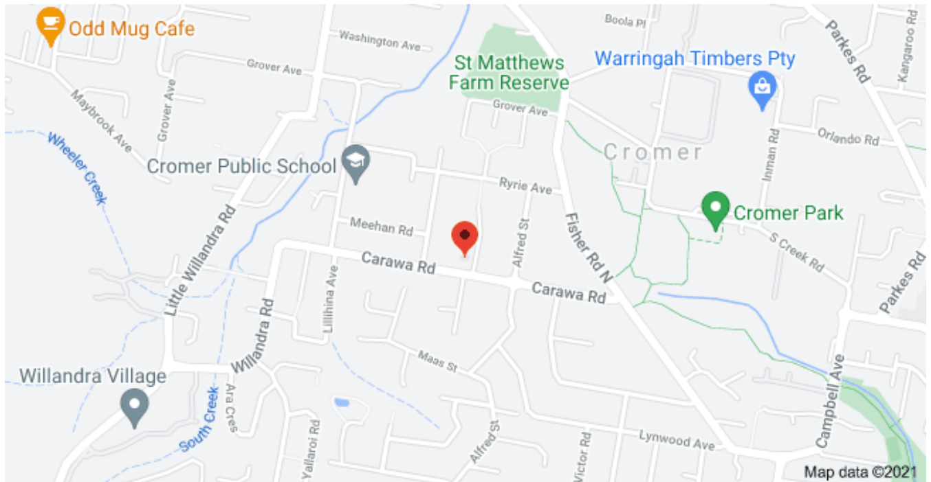
Site location