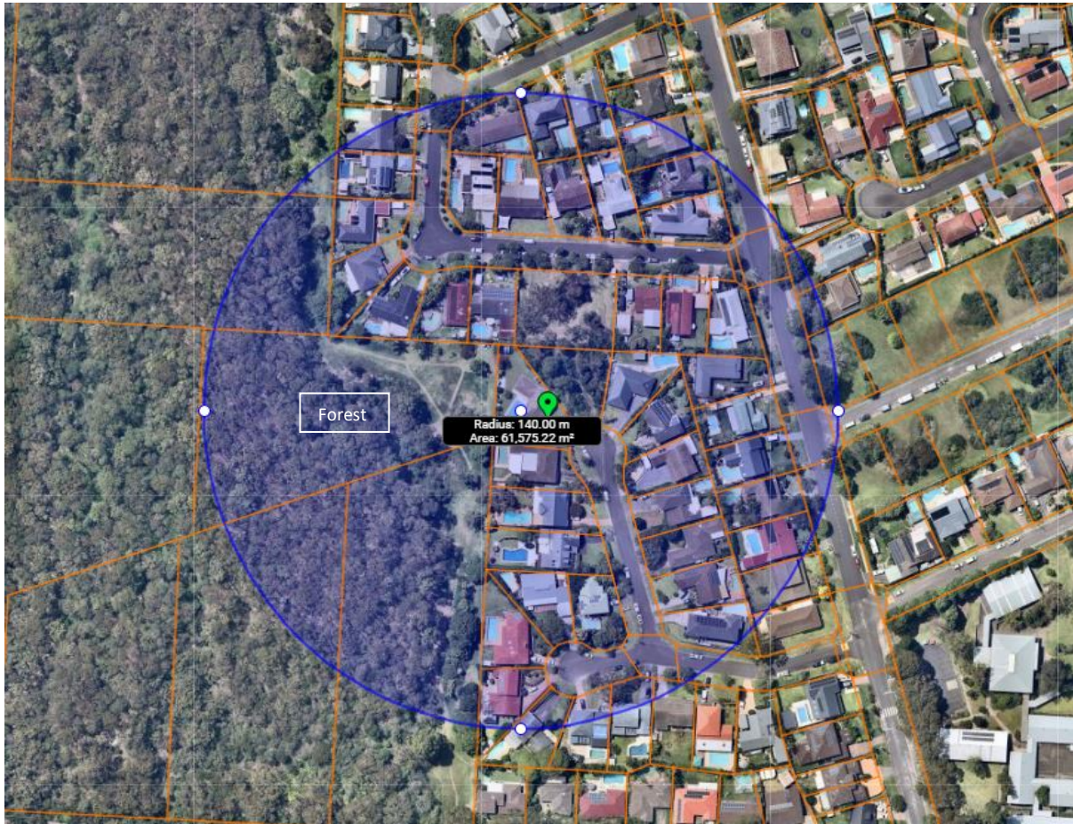
Figure 4: Aerial photo showing vegetation within 140m of the site.

There is a public reserve adjoining the eastern boundary known as 'Boronia Reserve'. This area is managed by Council and is of Low threat to the subject site.