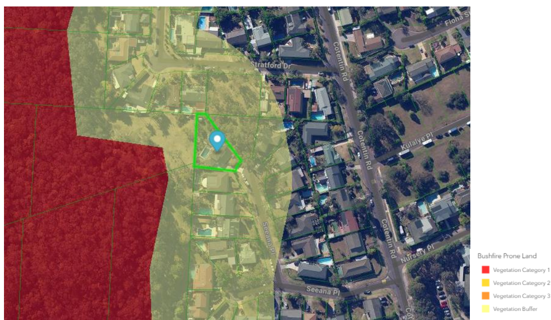
Figure 3: Bushfire prone land map showing the location of the subject site.