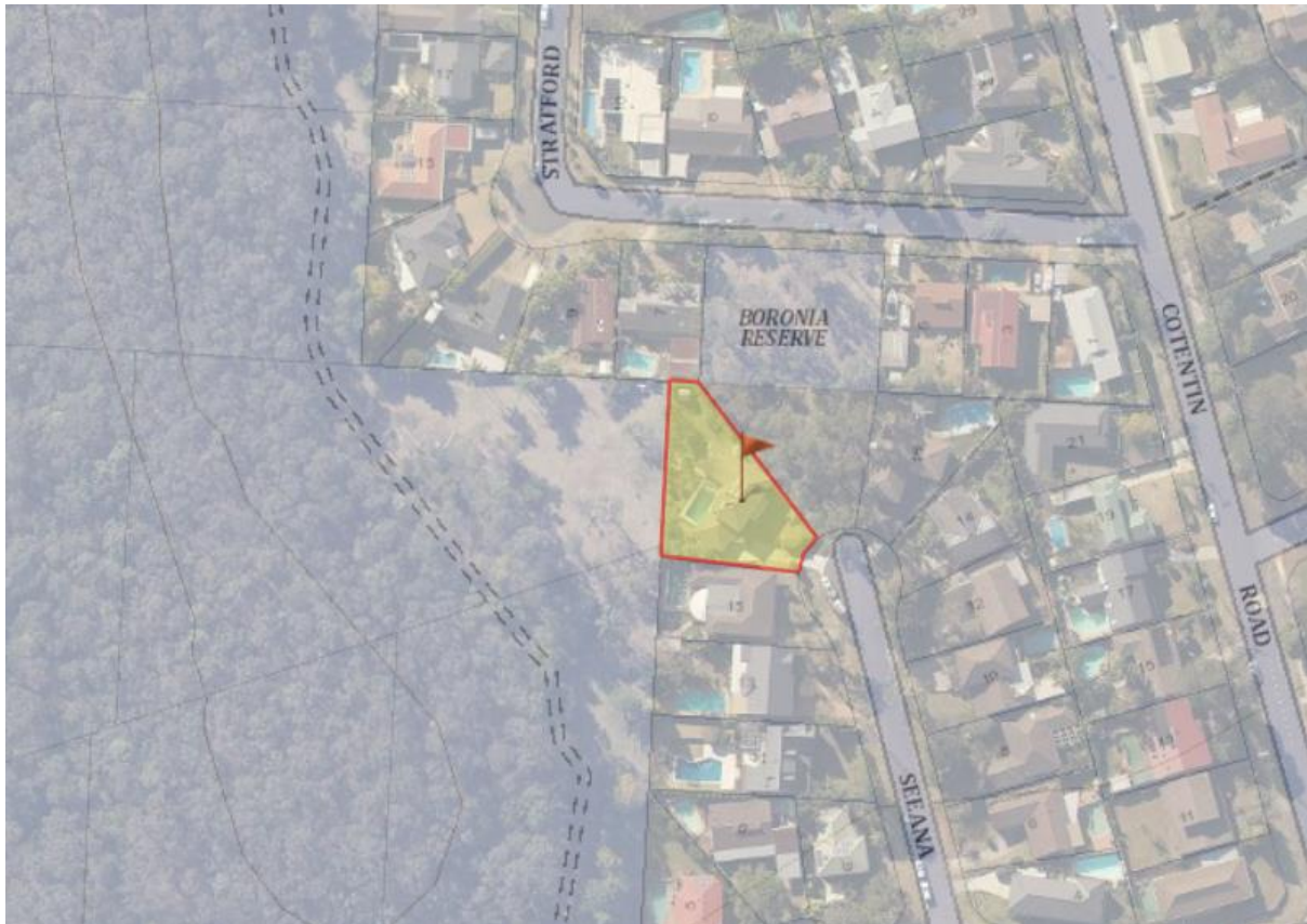
Figure 1: Location of the subject site

The development site is a residential block with access off Seeana Place. The following sections 4-8 describe in detail the vegetation, slope, access and egress, availability of water supplies and environmental considerations for the site.