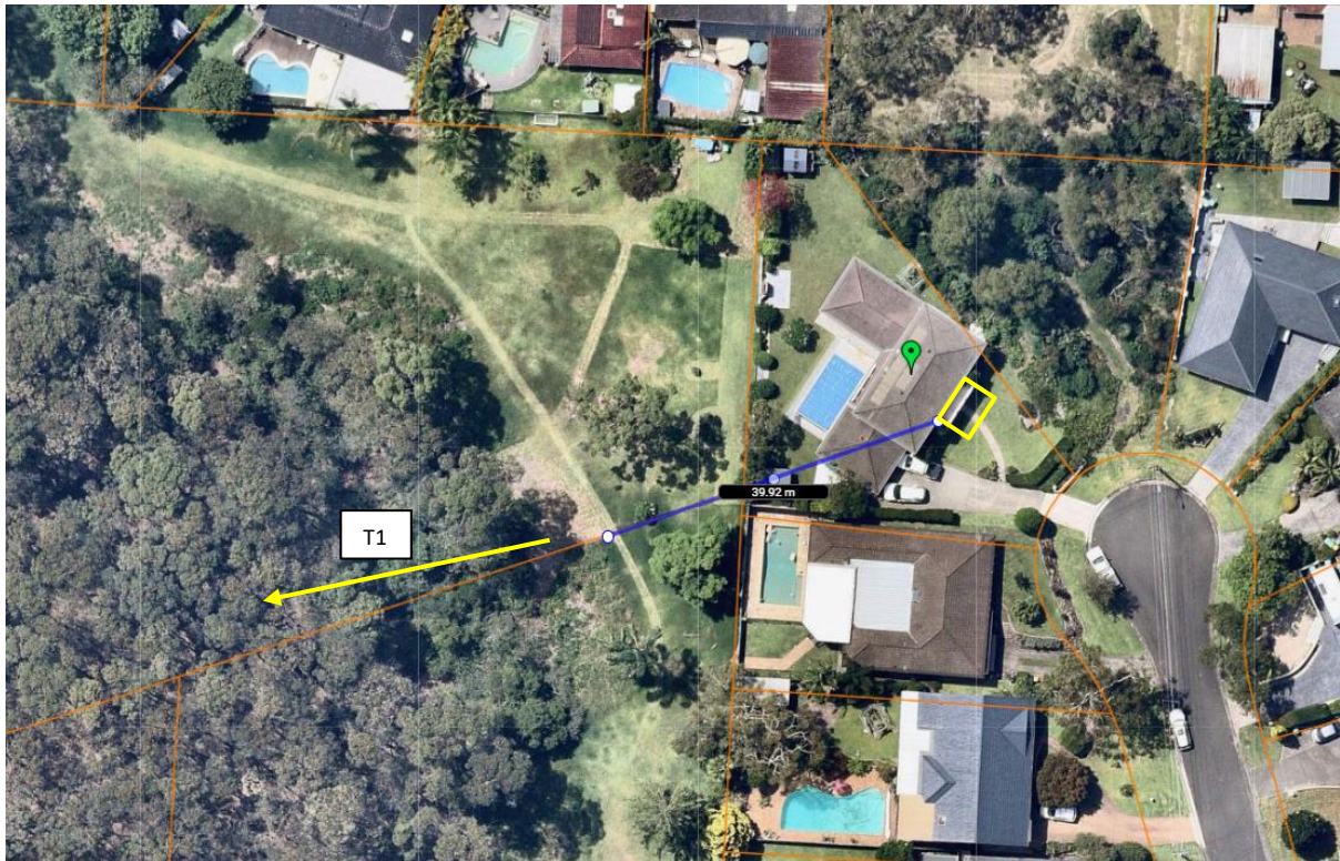
Figure 7: Aerial photo showing distance to surrounding vegetation.