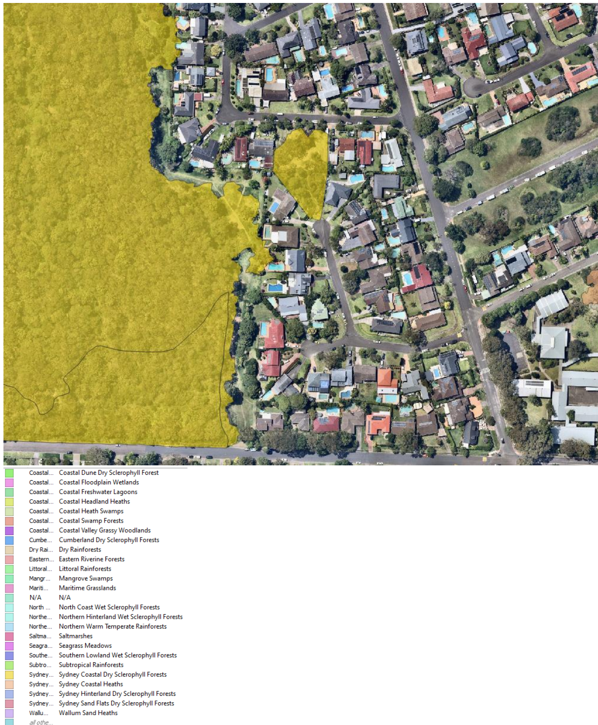
Figure 5: Aerial photo showing vegetation formations surrounding the subject site