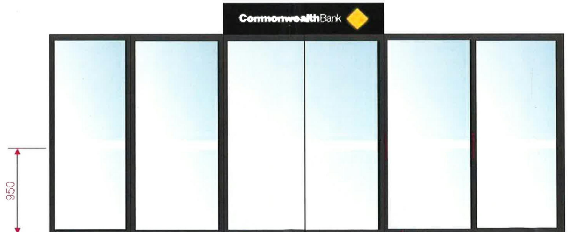
3 DA - SAFETY DECAL 1 : 25

PLEASE VERIFY ALL DIMENSIONS ON SITE BEFORE COMMENCING WORK. REPORT ALL DISCREPANCIES TO PROJECT DIRECTOR PRIOR TO CONSTRUCTION. FIGURED DIMENSIONS TO BE TAKEN IN PREFERENCE TO SCALED DRAWINGS. DRAWINGS MADE TO LARGER SCALES & THOSE SHOWING PARTICULAR PARTS OF THE WORKS SHALL TAKE PRECEDENCE OVER DRAWINGS MADE TO SMALLER SCALE & THOSE FOR GENERAL PURPOSES. ALL WORK IS TO CONFORM TO RELEVANT AUSTRALIAN STANDARDS & OTHER CODES AS APPLICABLE, TOGETHER WITH OTHER AUTHORITIES' REQUIREMENTS & REGULATIONS. THIS DRAWING & DESIGN IS SUBJECT TO COPYRIGHT & MAY NOT BE REPRODUCED WITHOUT PRIOR WRITTEN CONSENT. IF IN DOUBT, ASK.