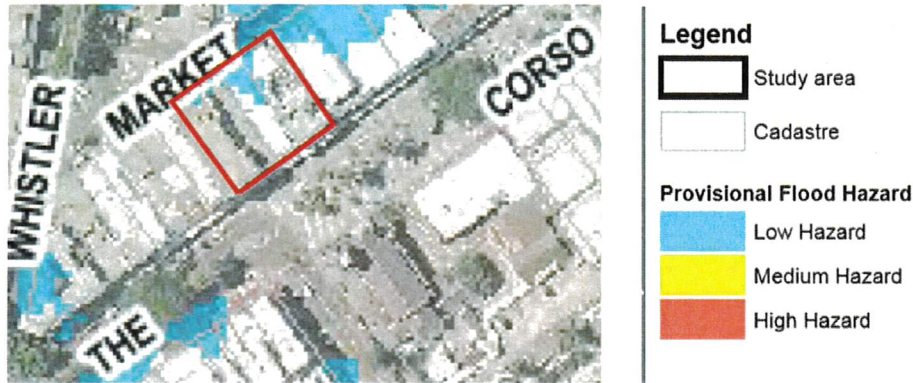
Figure 1. Extract From Manly to Seaforth Flood Study Figure 63 PMF Provisional Flood Hazard Map 3/4. Site outline in red added.