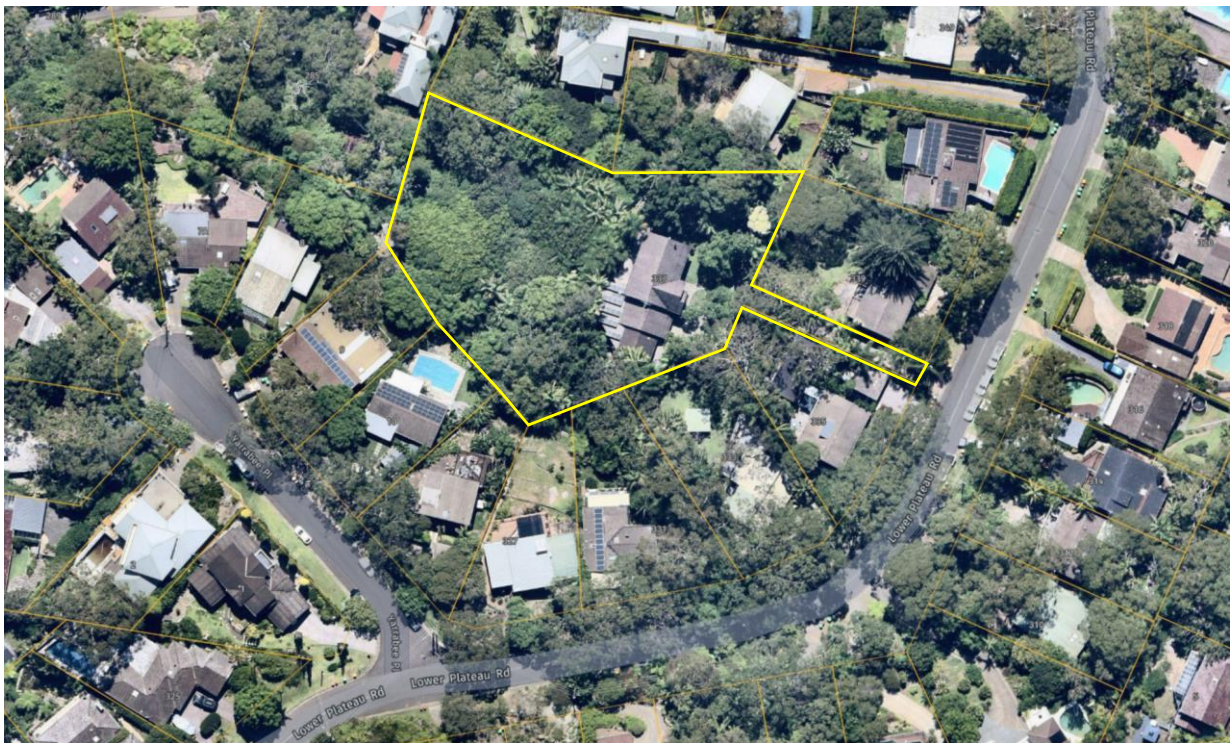
Figure 1: Aerial photograph of the subject site

An aerial location photograph is at Figure 1 below.