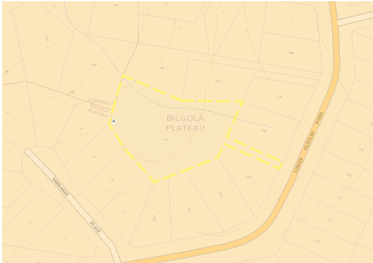
Figure 3: Extract of Zoning Map