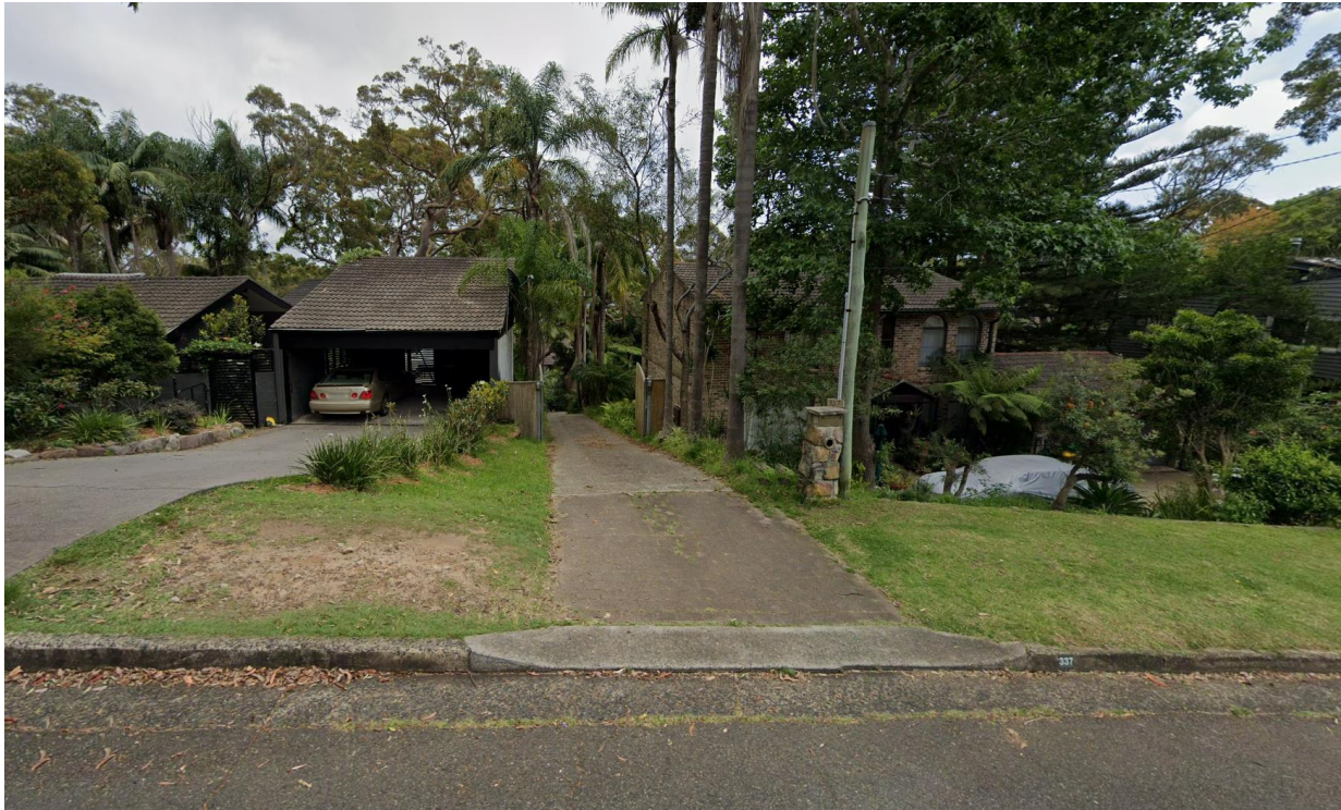
Figure 2: The driveway access from Lower Plateau Road (centre) with the neighbouring dwellings at 335 Lower Plateau Road (left) and 339 Lower Plateau Road (right)