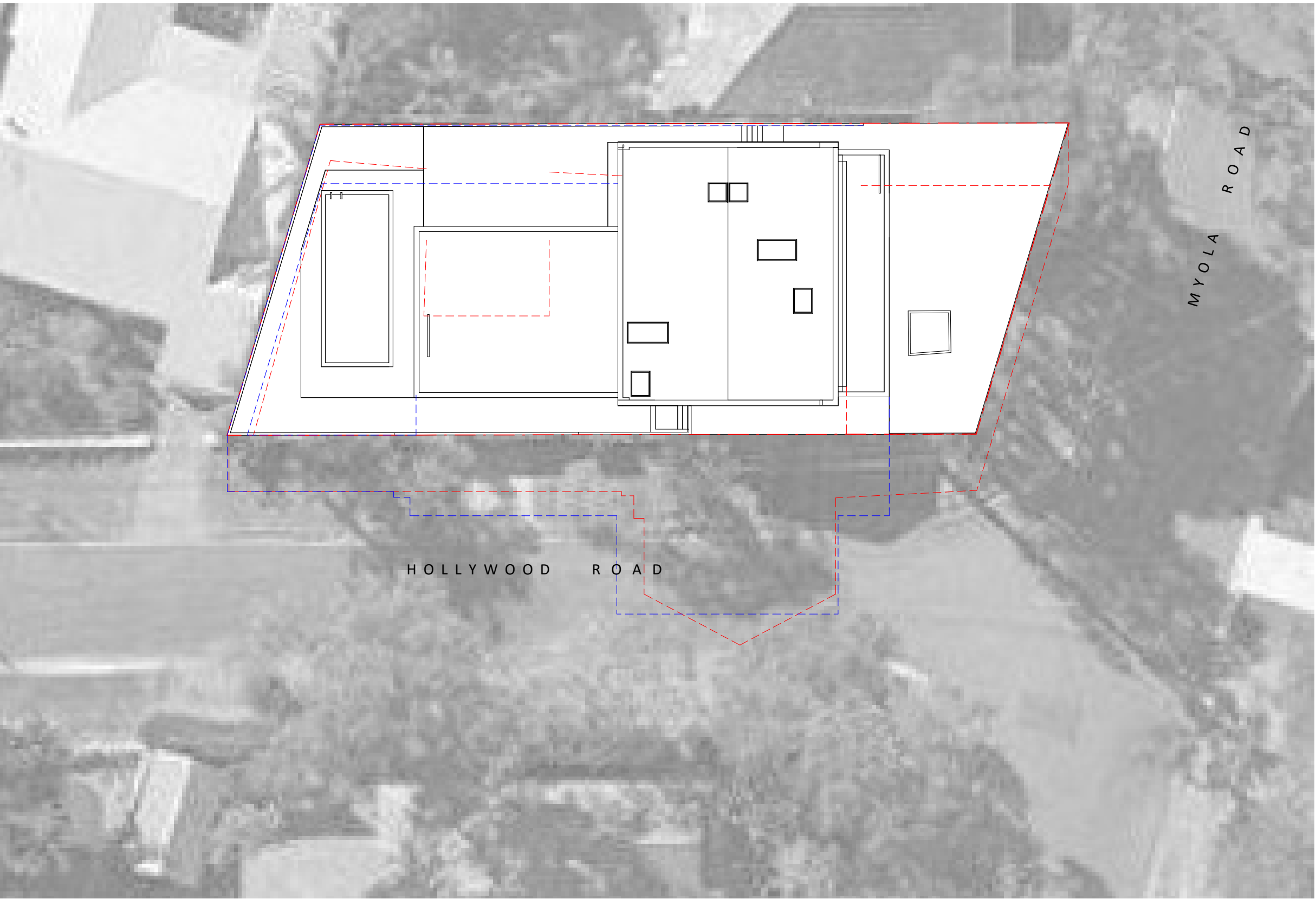
2 SHADOW DIAGRAM - 12PM, 21 JUNE