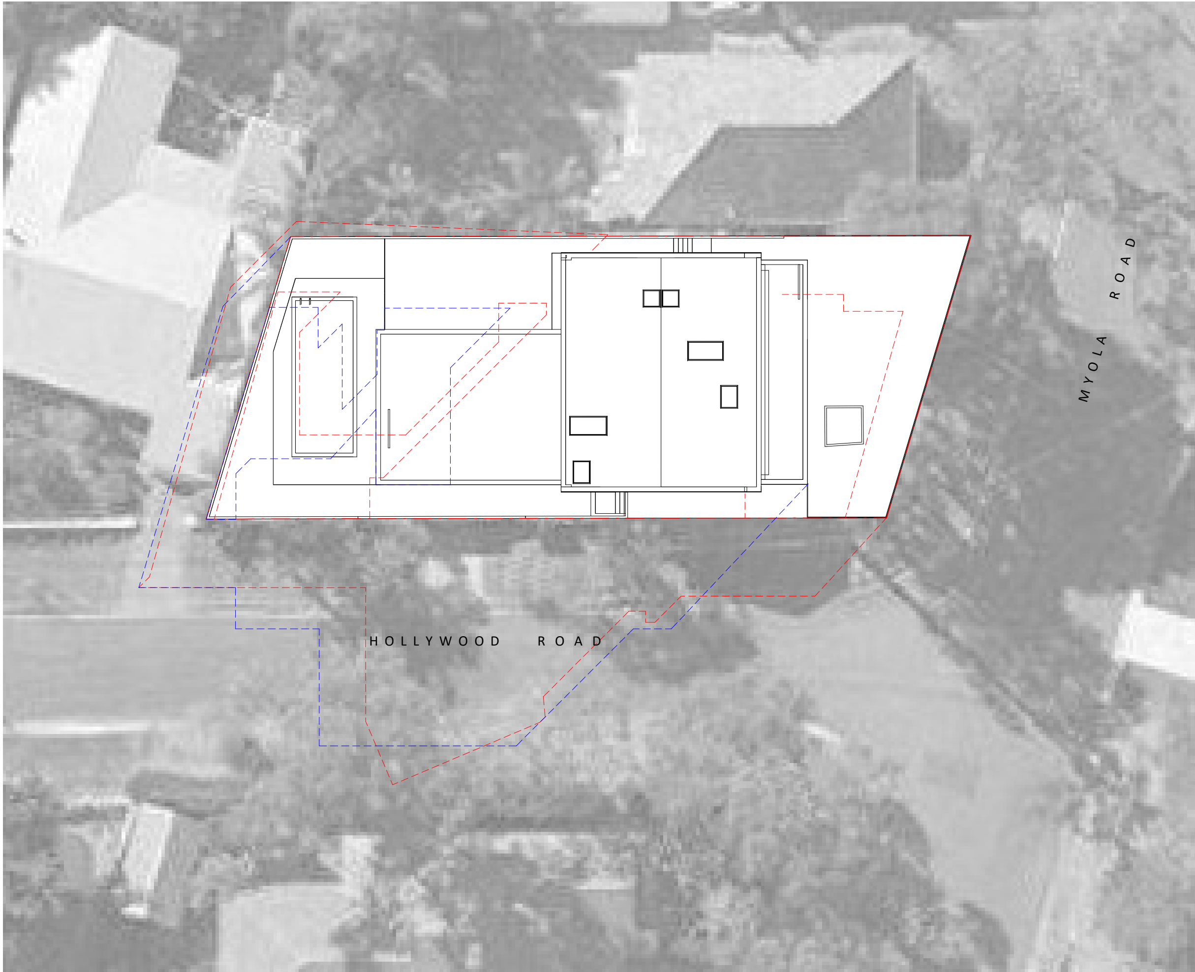
1 SHADOW DIAGRAM - 09am, 21 JUNE