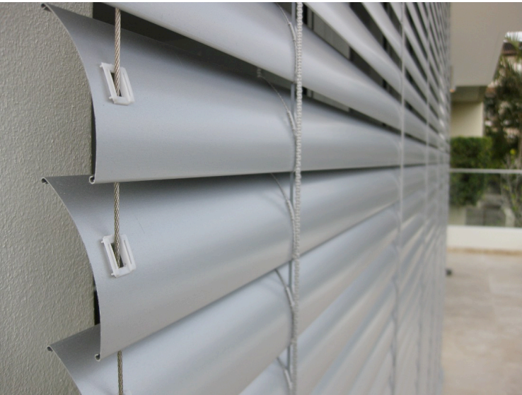
RETRACTABLE LOUVRES - CLEAR ANODISED ALUMINIUM