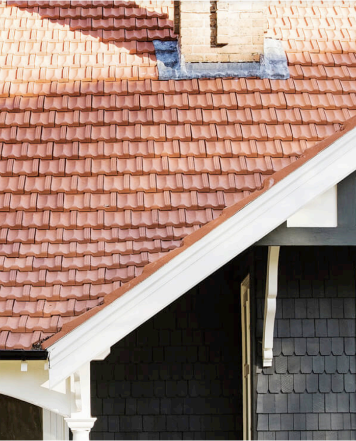
TERRACOTTA TILED ROOF - MARSEILLE RED