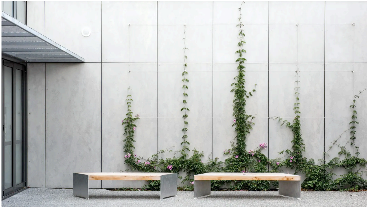
CLADDING - CEMINTEL BARESTONE EXTERNAL