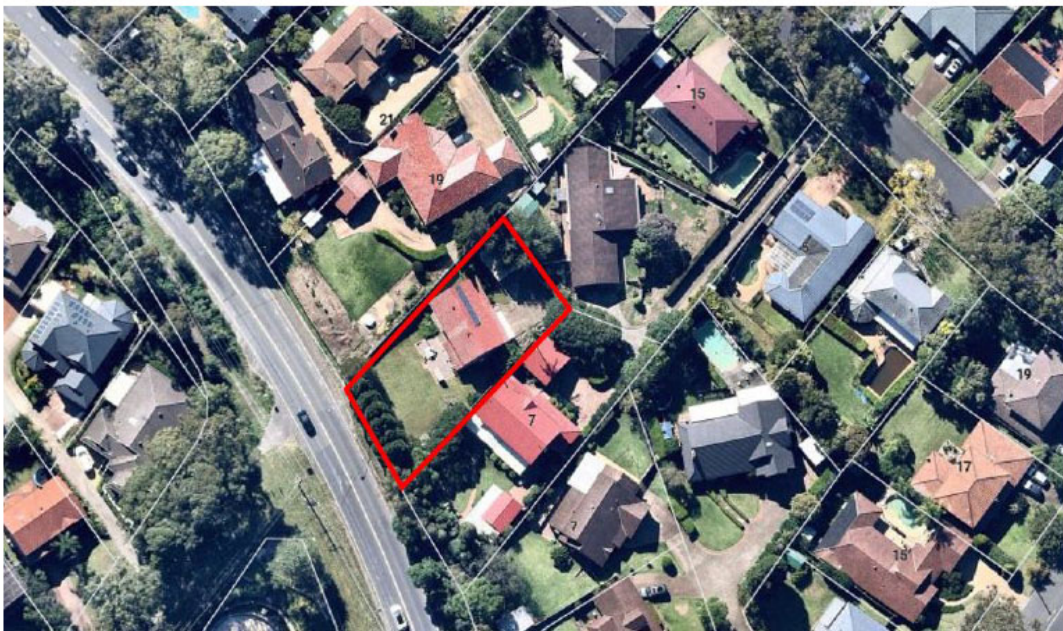
Figure 2: Aerial Photograph of Subject Site, which is identified by the red border. Note the access handle connecting to Tanbark Place to the centre/upper right of the image.