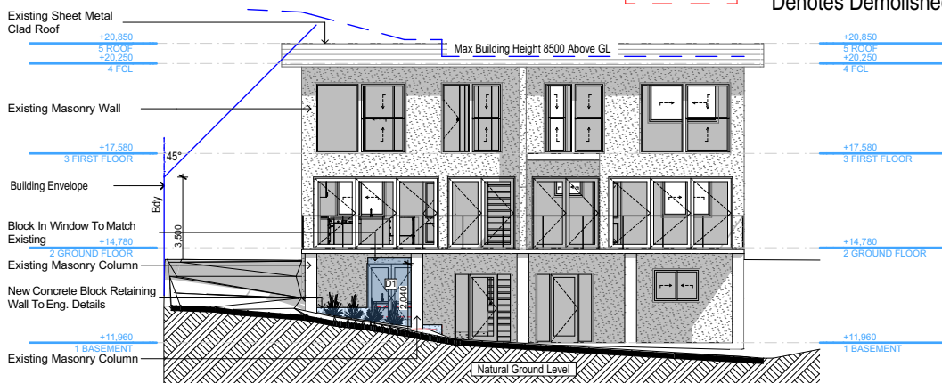
E-03 South 1:200