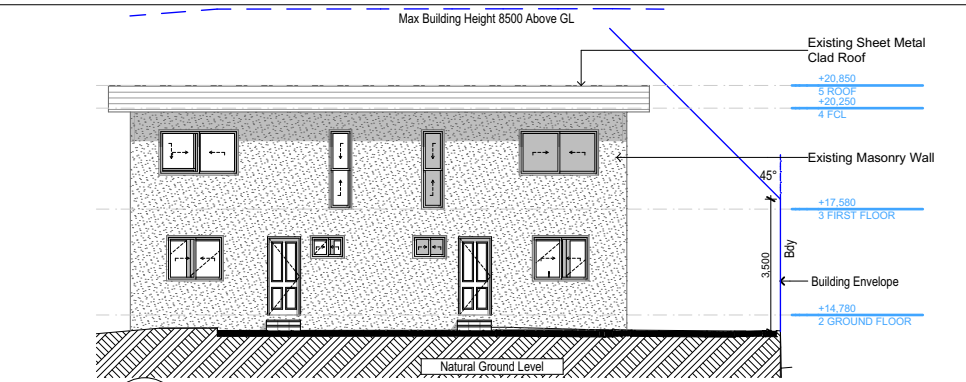
E-01 North 1:200