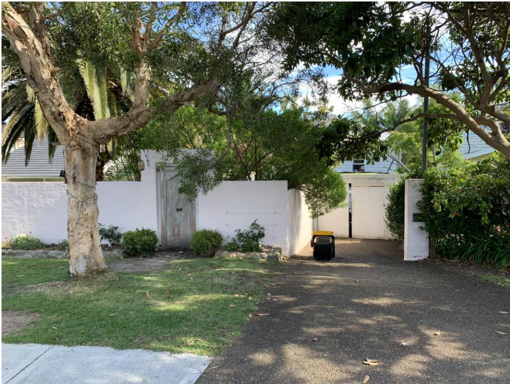
Fig 3: View of the neighbouring dwelling to the west at No 92 Queens Parade, with existing single garage on reduced setback and existing front fence