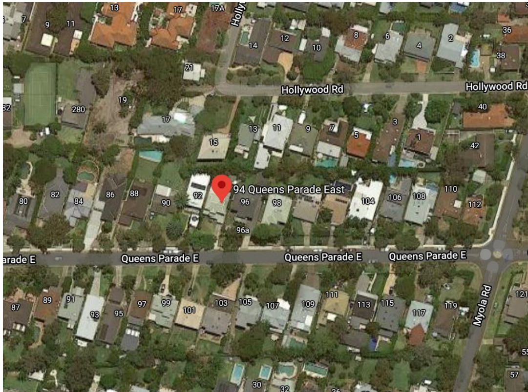
Fig 6: Aerial Photograph

Carports and other open parking structures within the front setback or in close proximity to the street boundary are common in the area.