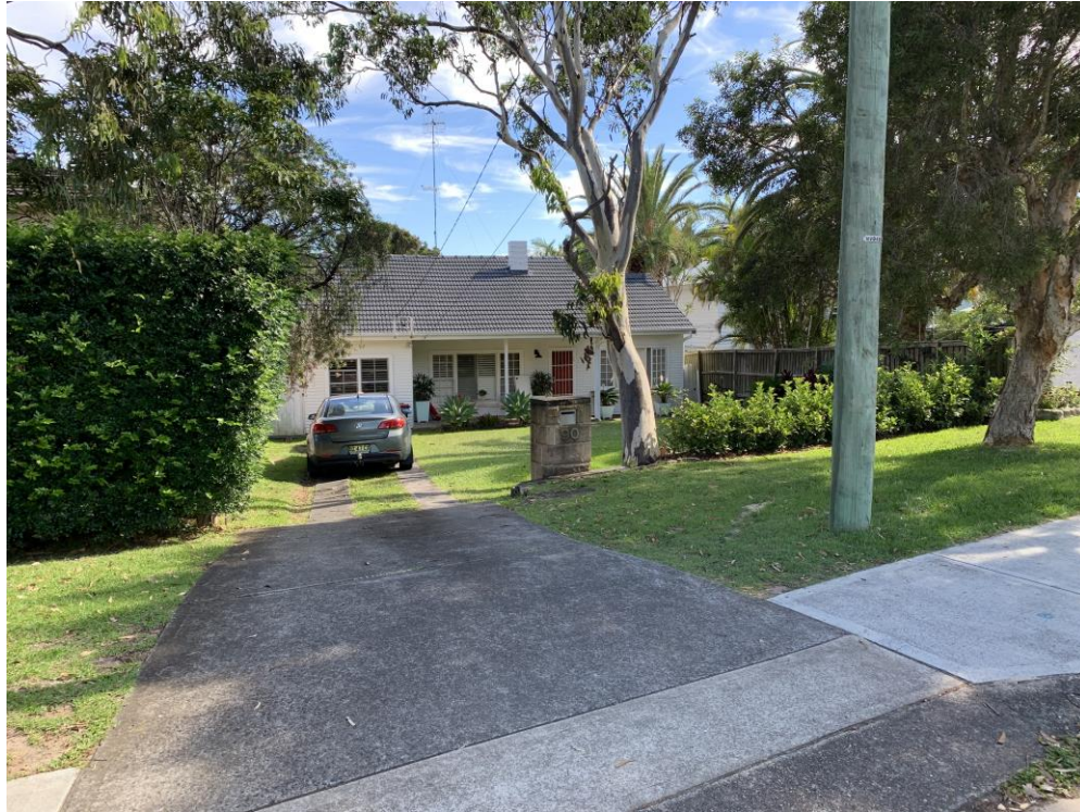
Fig 4: View of the nearby dwelling to the west at No 90 Queens Parade, with existing open parking area forward of the dwelling and likely location of covered car parking at a reduced setback to the front boundary