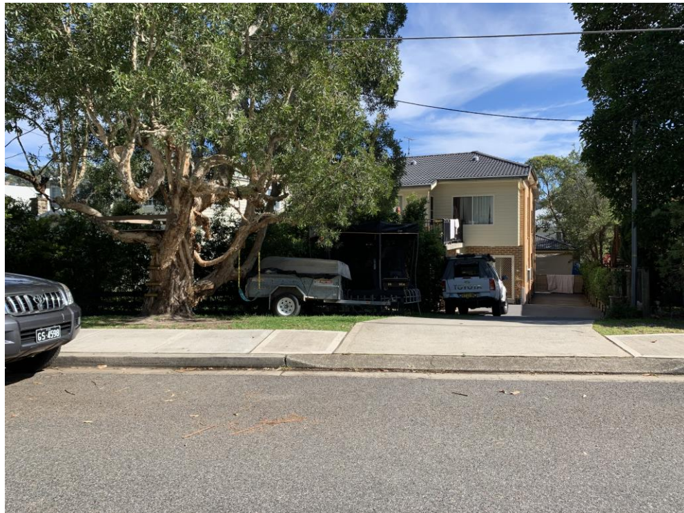
Fig 5: View of the neighbouring dwelling to the east at No 96 Queens Parade, looking north