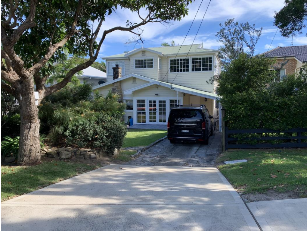
Fig 2: View of subject dwelling and location of proposed carport, looking north from Queens Parade