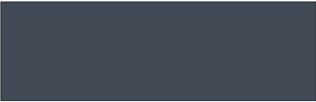
Matrix/Easylap Cladding: Taubmans Surfmist