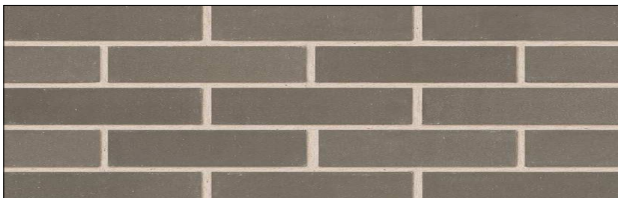
Main Brick: PGH smooth - Volcanic