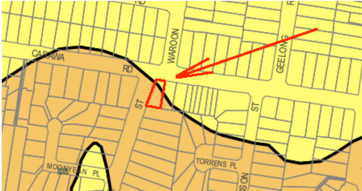
WARRINGAH LANDSLIP RISK MAP