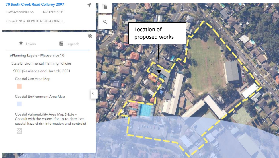
Figure 9: Extract – SEPP Resilience and Hazards, Coastal Use and Environment area map