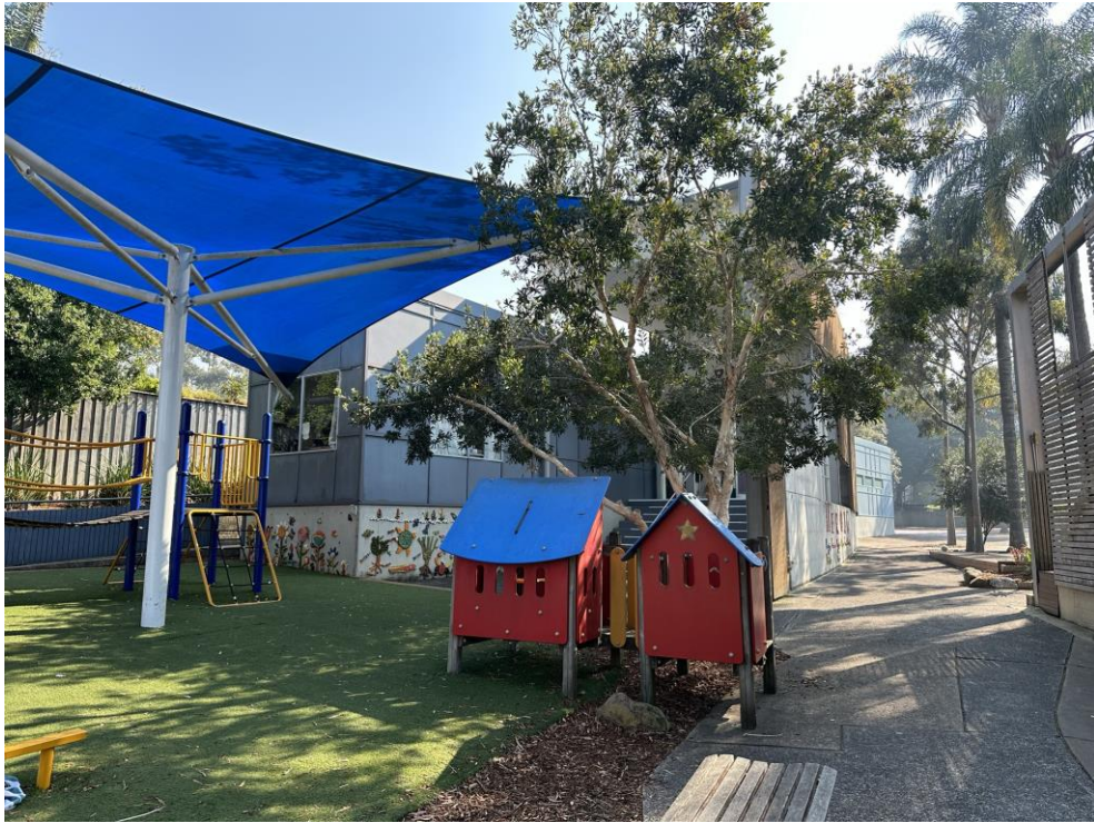
Figure 8. The existing early childhood centre playground.