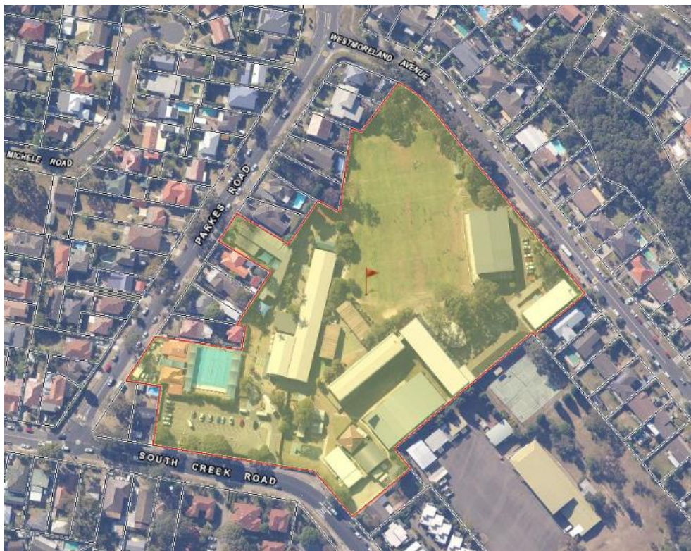
Figure 1. The site and its immediate surrounds