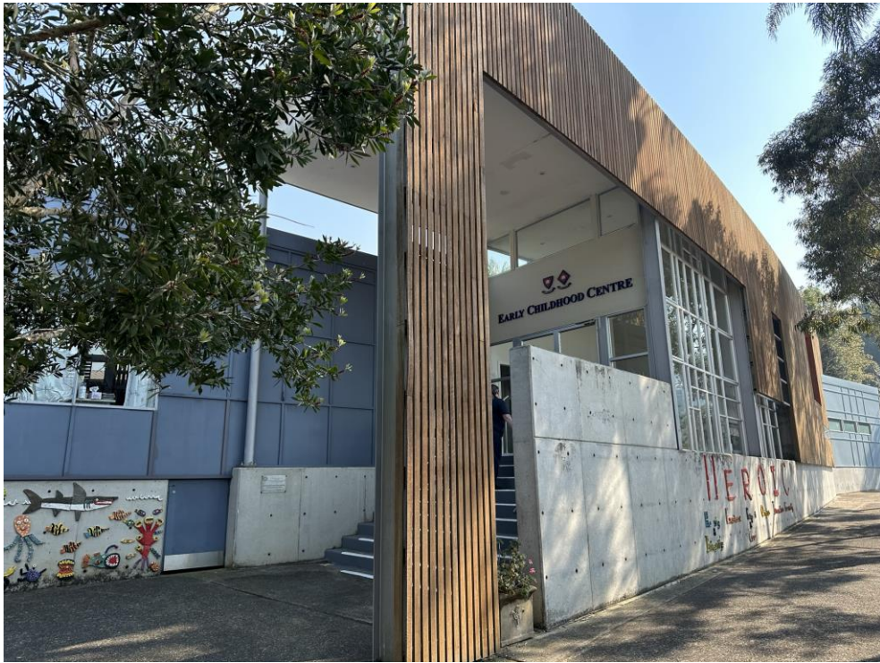
Figure 4. The existing early childhood centre.