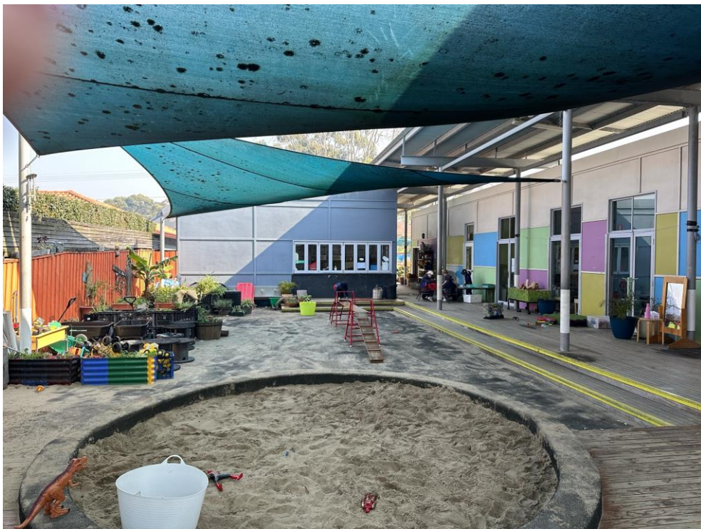
Figure 7. The existing early childhood centre playground and sandpit.