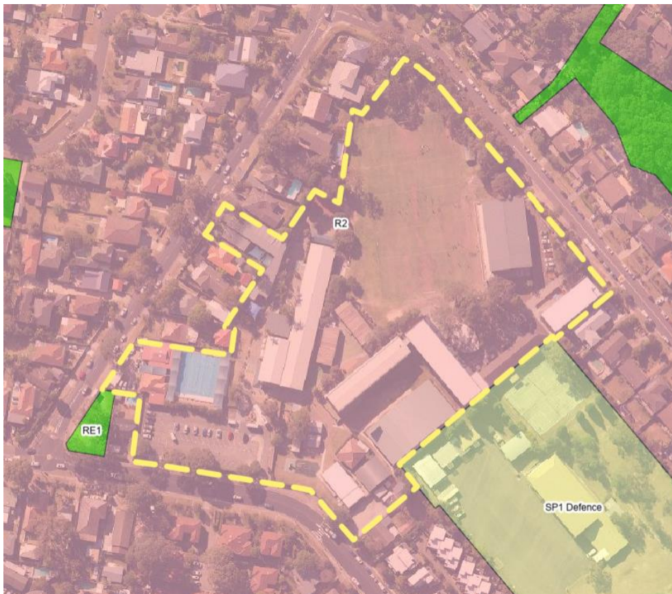
Figure 10: Extract from Warringah LEP 2011 Zoning Map

The subject site is zoned R2 Low Density Residential, pursuant to the provisions of the Warringah Local Environmental Plan 2011 and Educational establishments are permitted with consent in the R2 Zone.