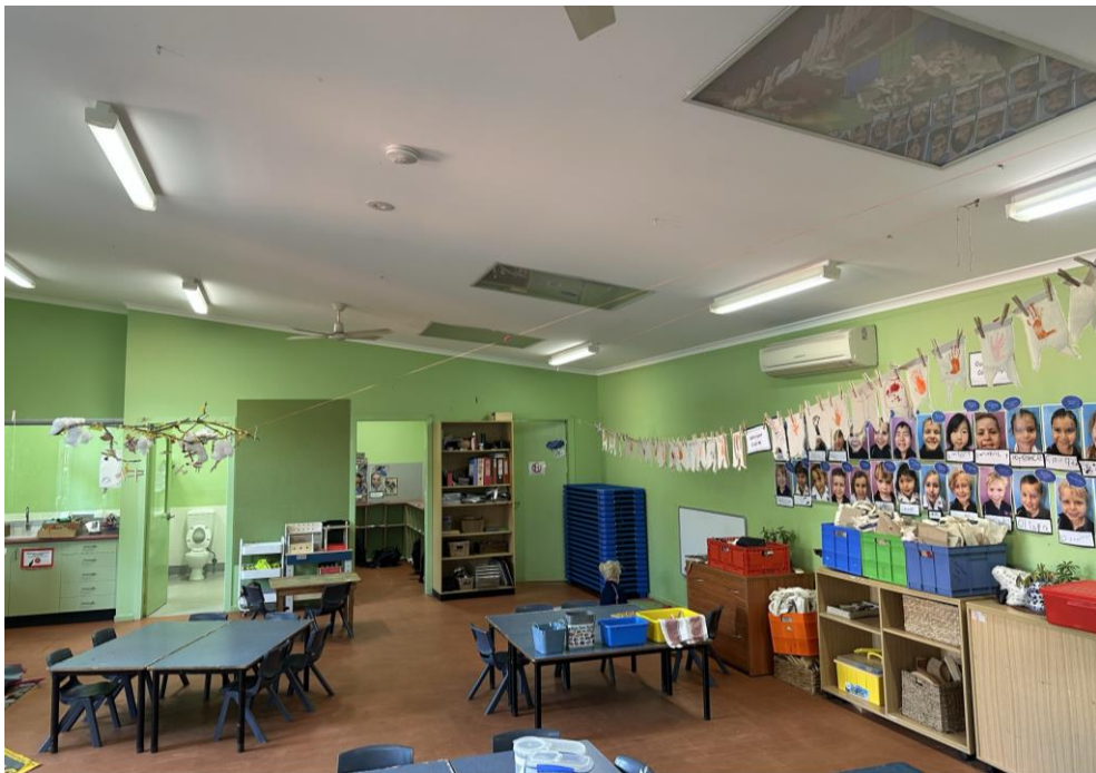
Figure 5. The existing early childhood centre rooms, proposed to become classrooms.