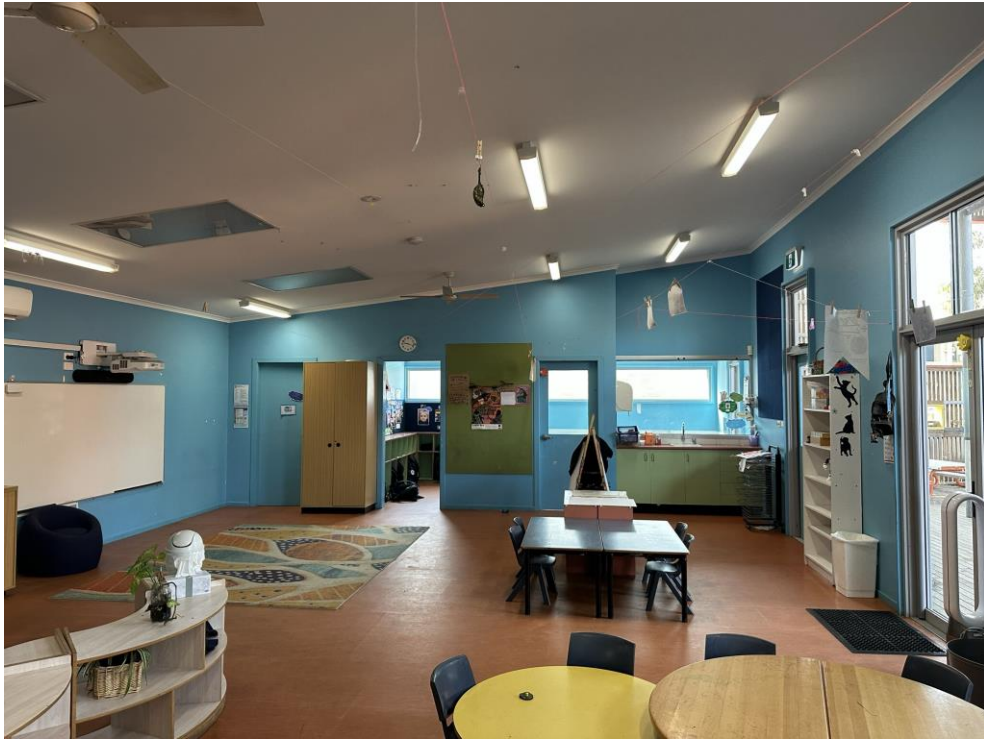
Figure 6. The existing early childhood centre rooms, proposed to become classrooms.