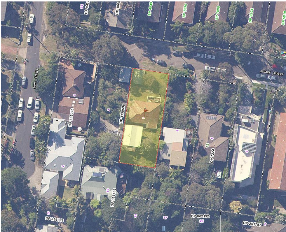
Figure 1: Subject Site

The site incorporated a significant cross-fall, sloping from the southwest corner of the site towards the northeast corner with 15 metres different in levels. The site has been identified being located within Landslip Risk Area E. The land is subject to one easement and one restriction on the title.