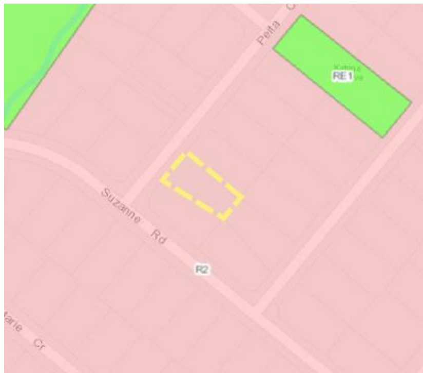
Zoning map of the site.