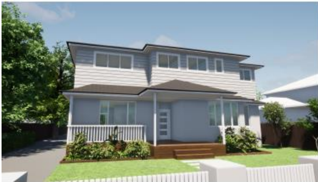
Proposed Streetscape elevation