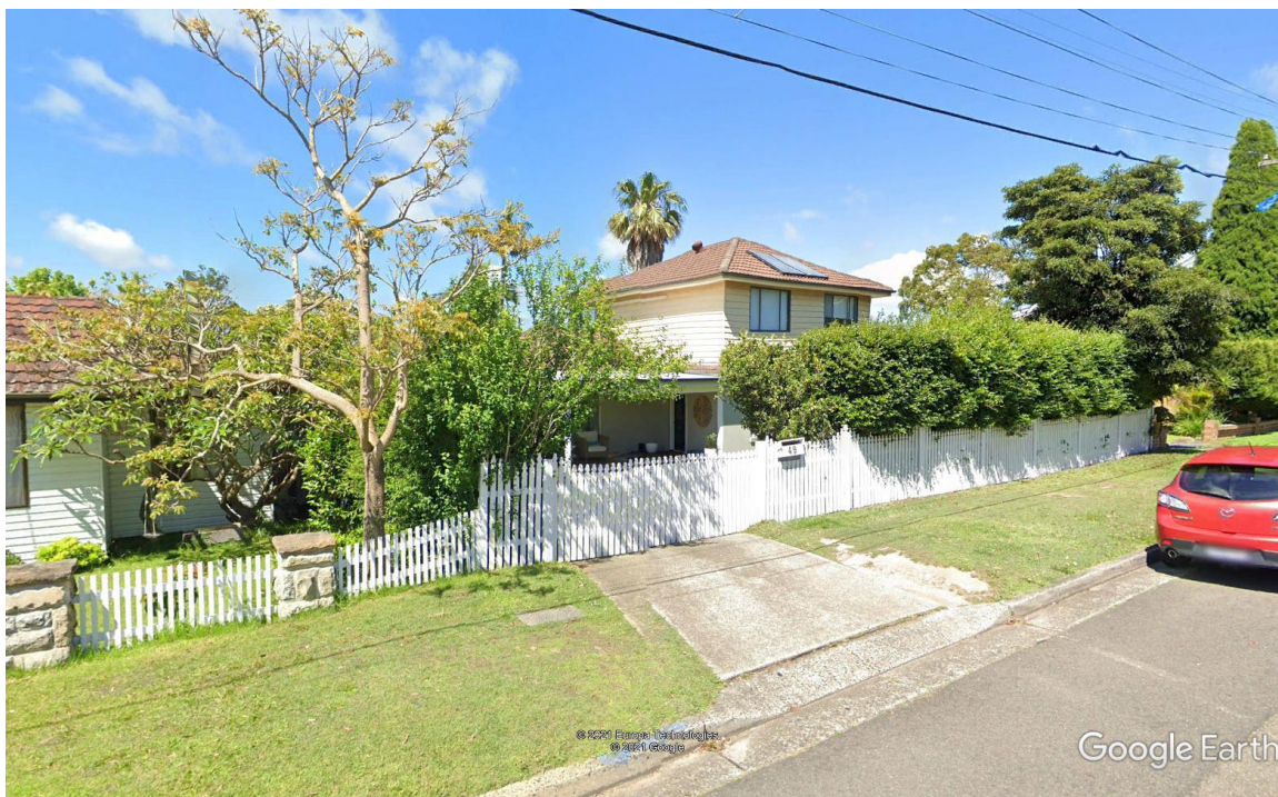
View of the western adjoining property