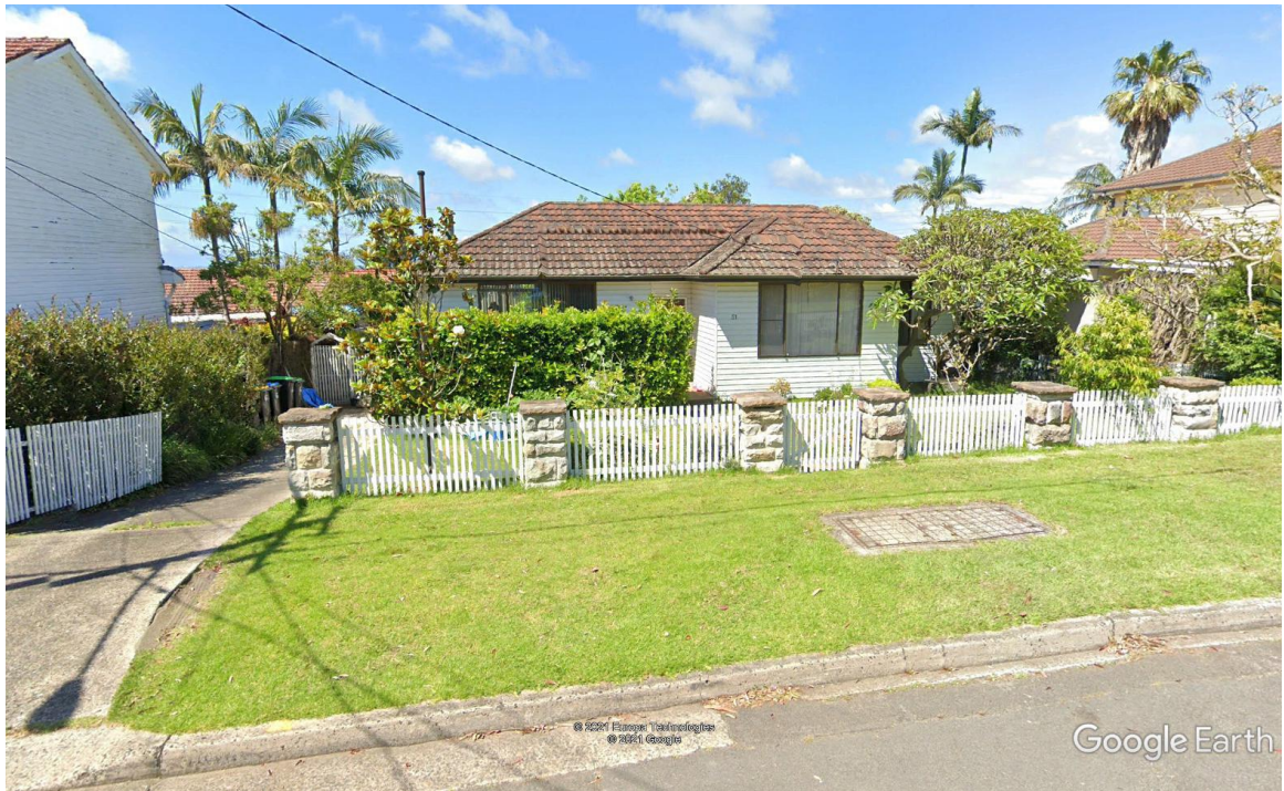
View of the existing dwelling from the street

The building is not listed under the Warringah Local Environmental Plan 2011 as having any heritage significance nor is it in the immediate vicinity of any items of heritage significance.