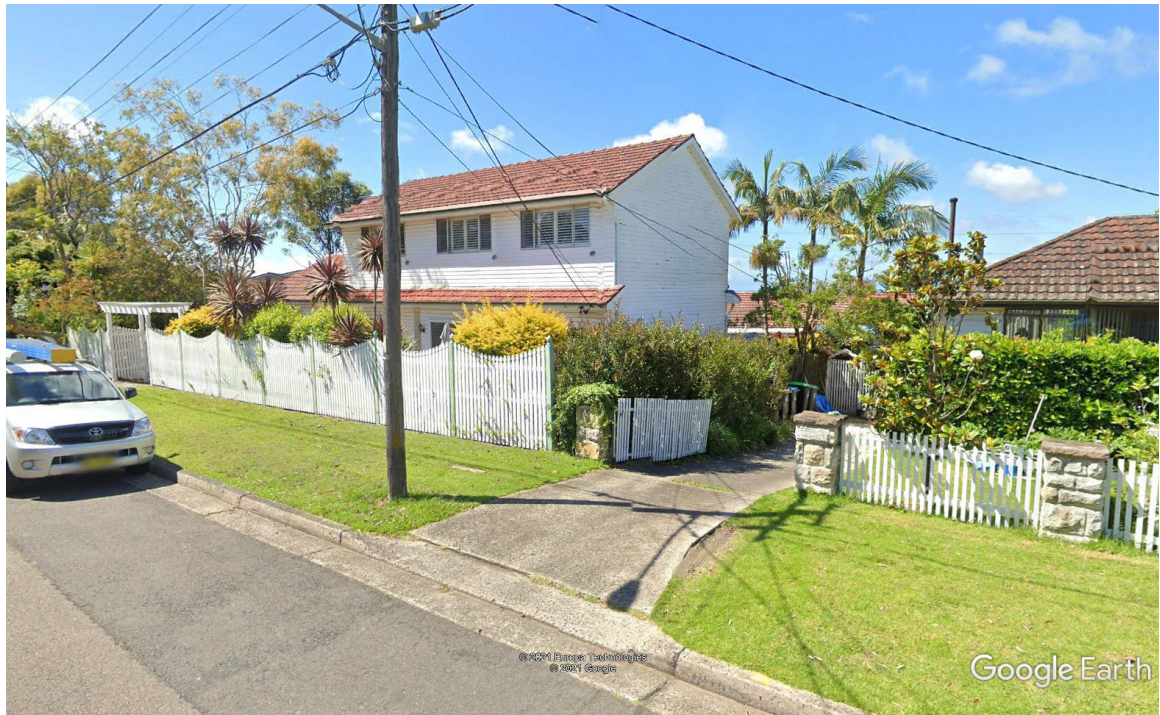
View of the adjoining eastern property

The adjoining 2 storey dwelling is well distant from the dwelling on the subject site and is separated by a formal hedge and driveway which runs along the boundary. Notably there are no windows in the western elevation of the adjoining dwelling. The proposed upper level addition on the subject site contains only 2 highlight type windows in its eastern elevation. No issues arise in terms of privacy loss.