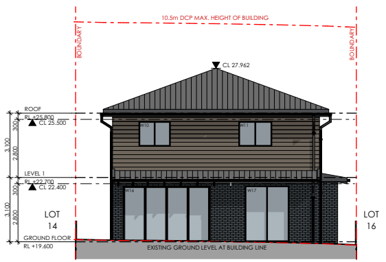
4 SOUTH ELEVATION 1:250