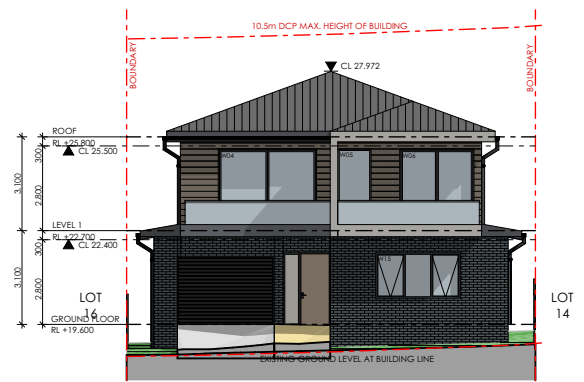
3 NORTH ELEVATION 1:250