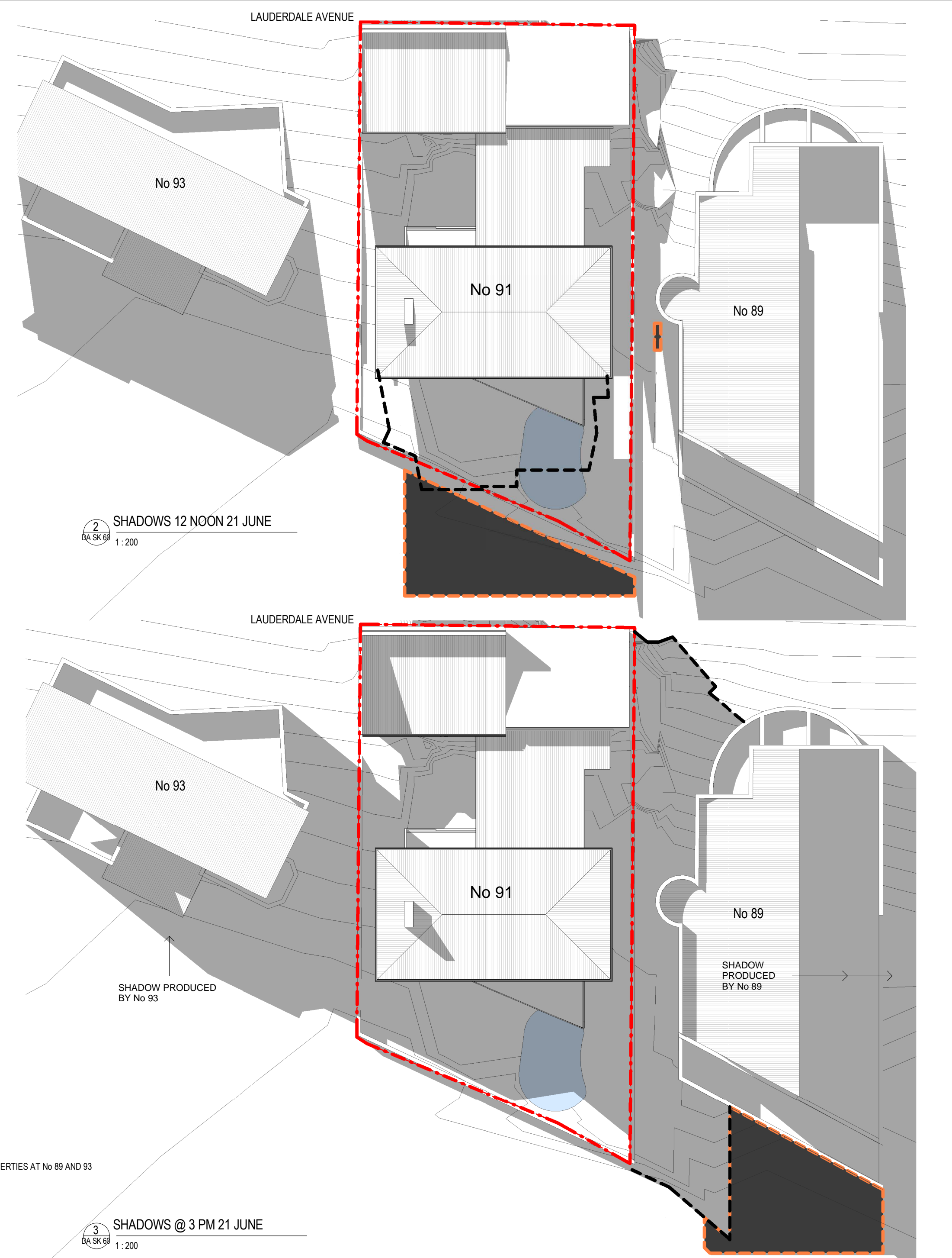
2 SHADOWS 12 NOON 21 JUNE DA SK 60 1:200