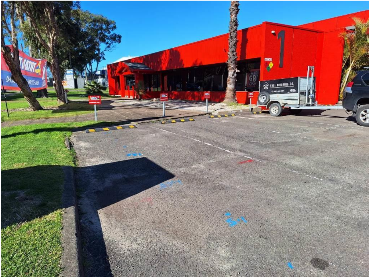
Building as is, including signed car parking "Total Tools". DA not approve yet.