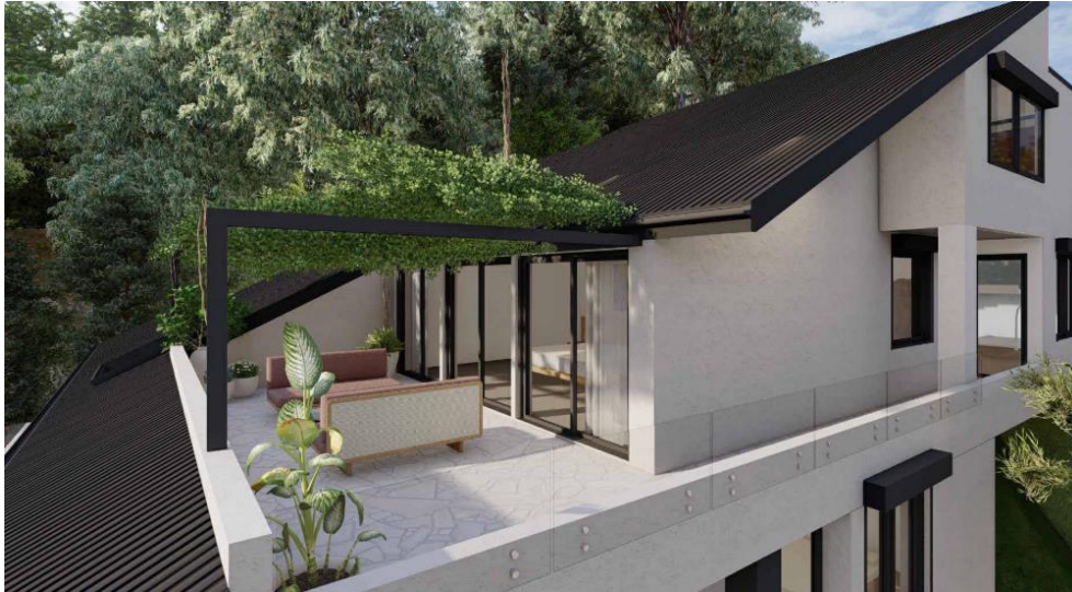
Figure 2: Extract: Illustration of Proposed Pergola on Level 3.

The numerical height variation results from the significant slope of the site and the works will not substantially alter the existing built form. It is considered this objective is met, despite the numerical variation.