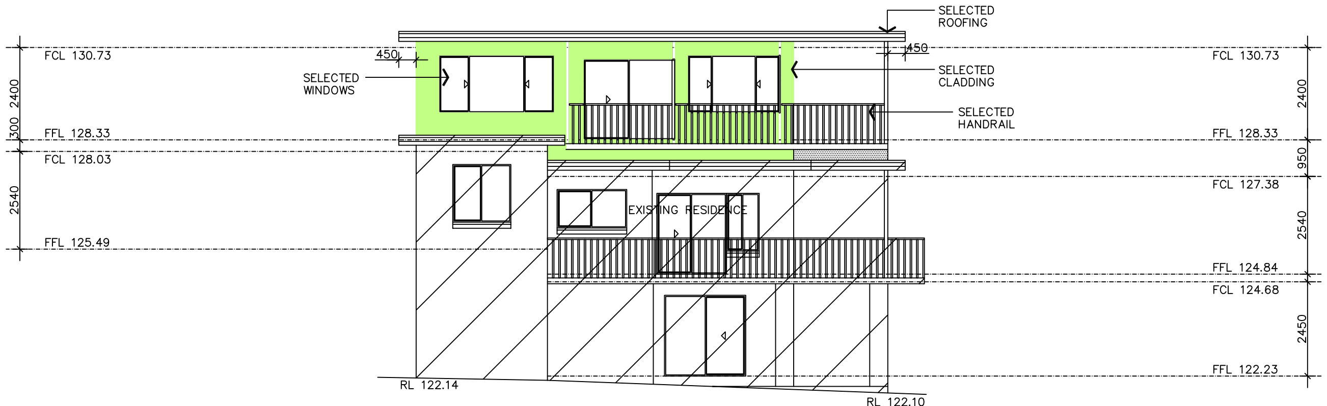
PROPOSED LEFT SIDE ELEVATION (east)

DESIGN & DRAFTING SERVICES PHONE - 0407224563