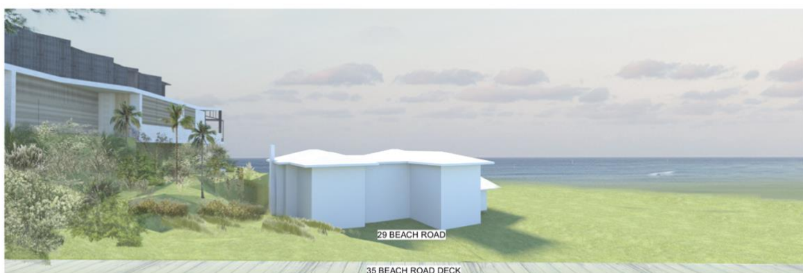
01 VIEW FROM 35 BEACH ROAD DECK

We contend that these matters give grounds for refusal of this DA.