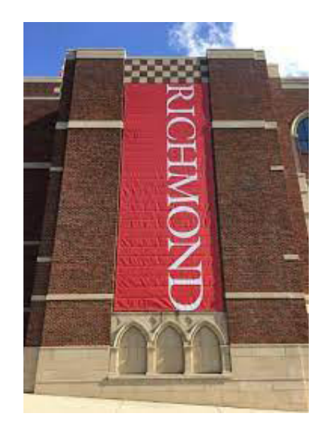
Breeze cloth/mesh for perimeter signage