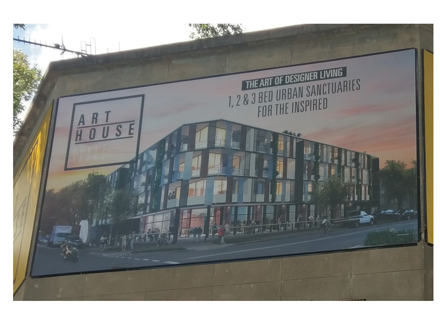
Vinyl Banner with Sail track for building signage