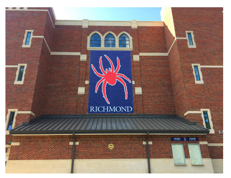
Breeze cloth/mesh for perimeter signage