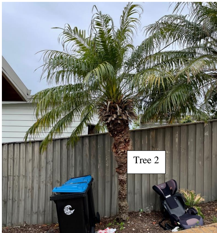
Figure 3: Tree 2, Dwarf Date Palm

Tree 3 Description (assessed by VTA on 29.11.2021).