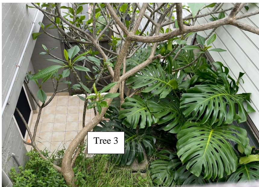
Figure 3: Tree 3, Frangipani

Comments: This tree is 'Exempt' due to its size being less than 5 metres, and it is in a 10/50 vegetation clearing area for fire safety.