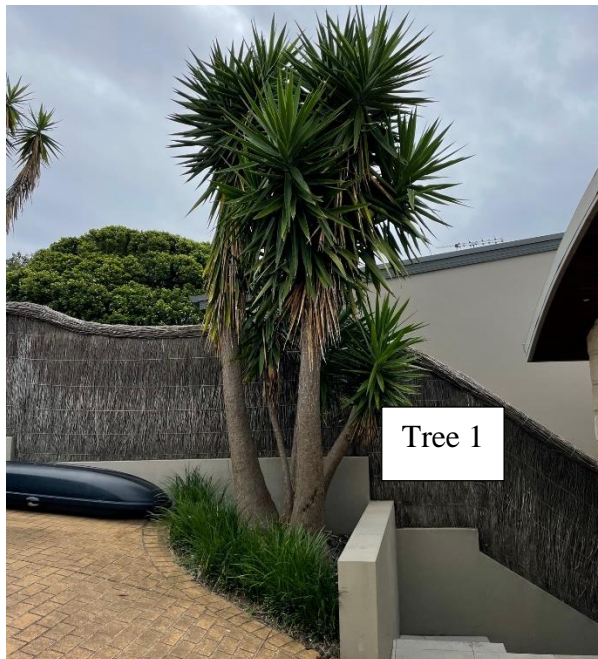
Figure 2, Tree 1, Yucca .

Comments: This tree is 'Exempt' due to its size being 5 metres and it is in a 10/50 vegetation clearing area for fire safety.