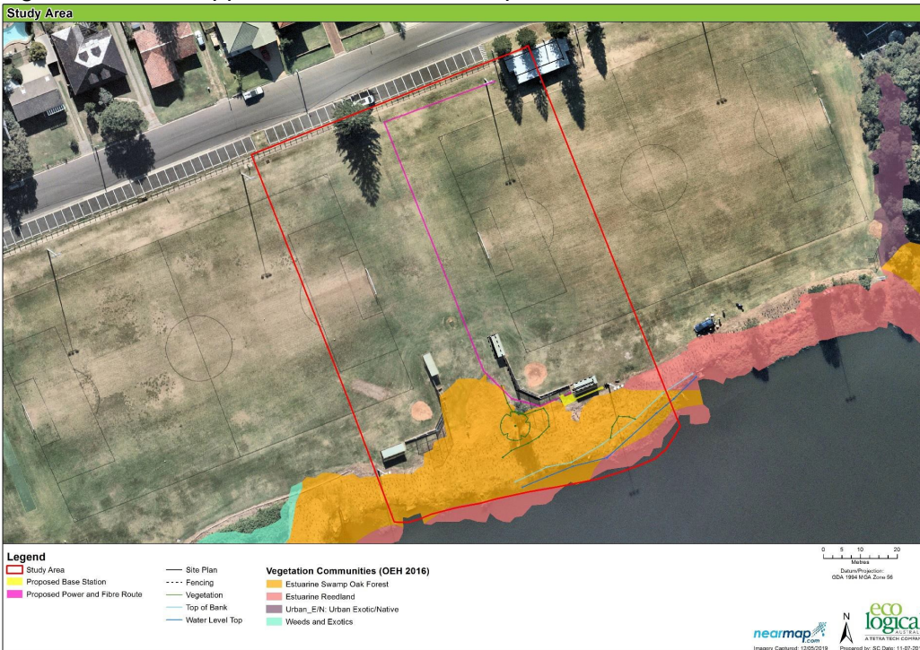
Figure 2 - land mapped as Native Vegetation