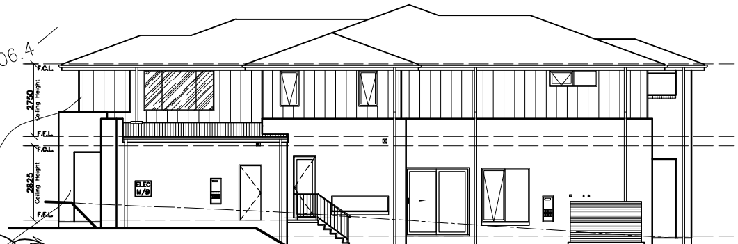
ELEVATION 2 -SOUTH-