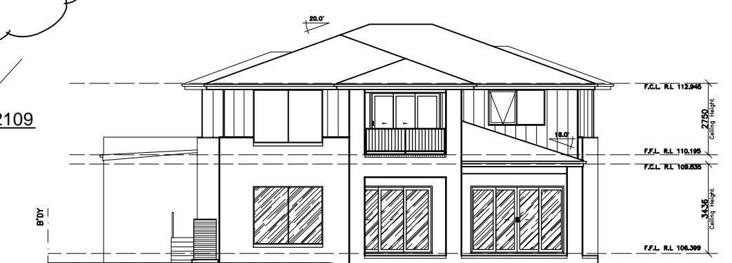
ELEVATION 3 -EAST-