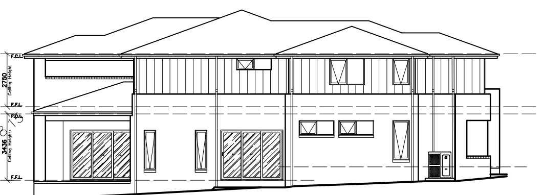
ELEVATION 4 -NORTH-