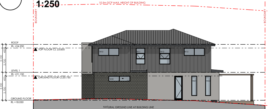
4 SOUTH ELEVATION 1:250