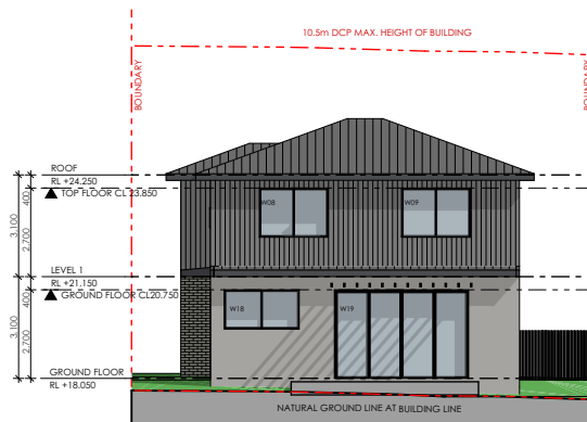
2 EAST ELEVATION 1:250