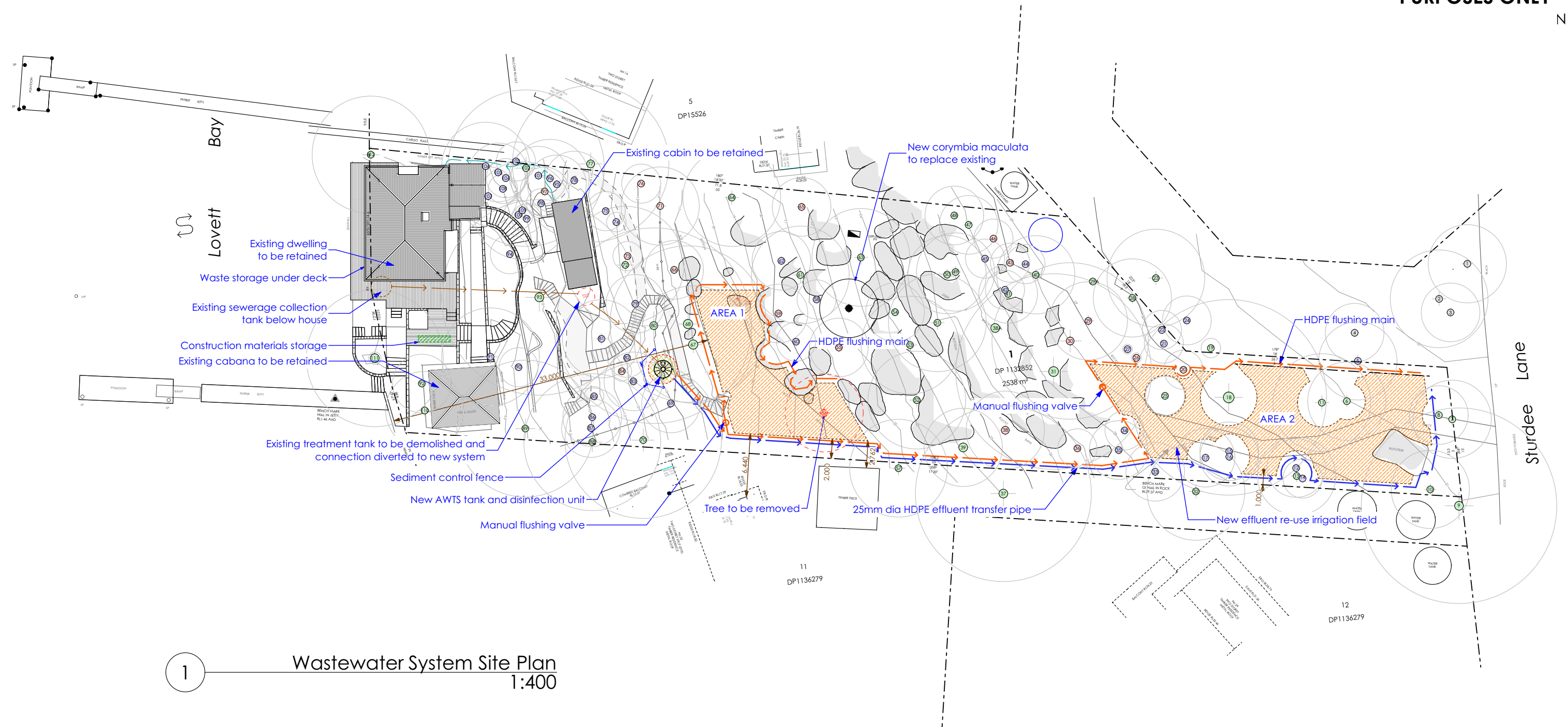
1 Wastewater System Site Plan 1:400