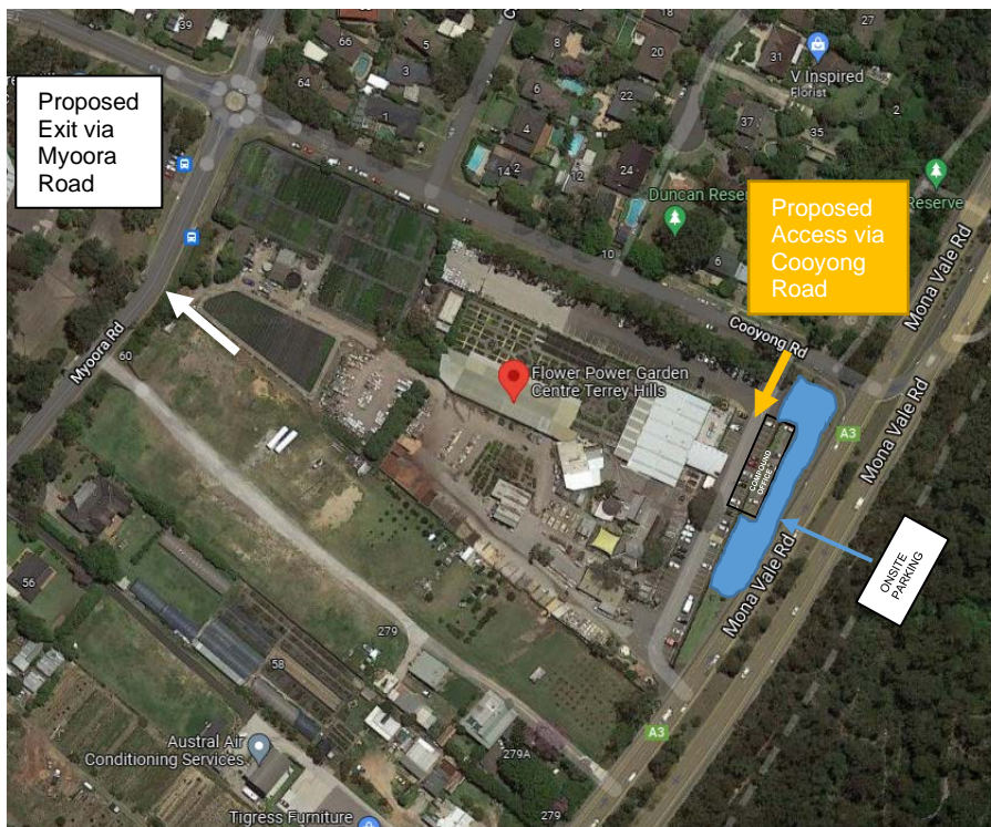
Figure 1 - Proposed Access & Parking