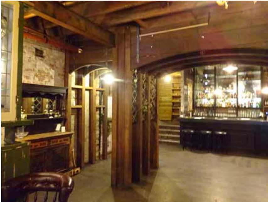
Figure 4.32 2018 Existing Blacket's Bar, second floor