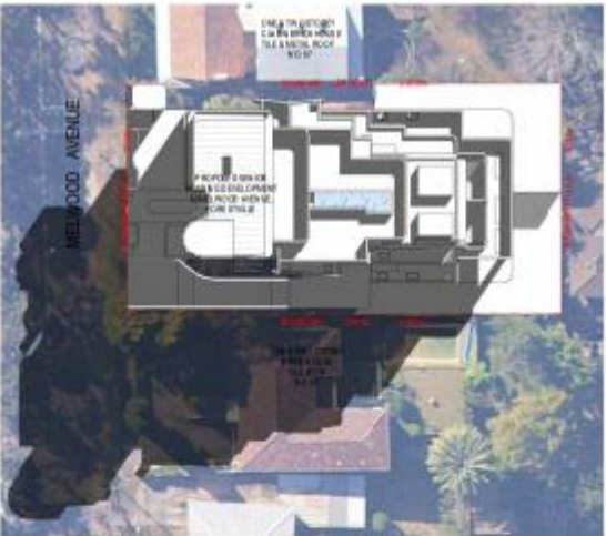
1 SHADOW DIAGRAM - 9AM, 21 JUNE