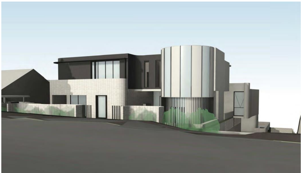
Figure 1 - Perspective image of the development as viewed from the street.

Response: The building is compliant with the front setback and building height provisions as it presents to the street with the proposal designed to present as a complimentary and compatible 2 storey element as viewed from the street. The street facing building façade has been highly articulated and modulated with the articulation zone provided adjacent to the entry assisting in breaking the horizontal massing of the development and ensuring a contextually appropriate streetscape presentation. Landscaping has integrated into the front façade of the development to soften and screen the building as viewed from the street as depicted in the perspective image below.