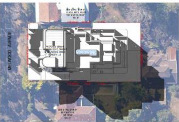
3 SHADOW DIAGRAM - 15PM, 21 JUNE