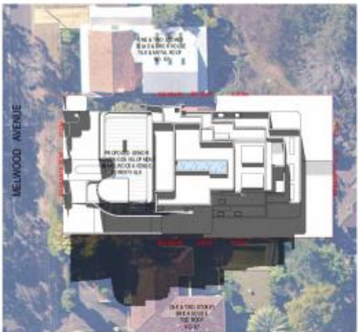
2 SHADOW DIAGRAM - 12PM, 21 JUNE 1:30

Group Group size Age range Sex HF 8/2 25 10 F, 10 M