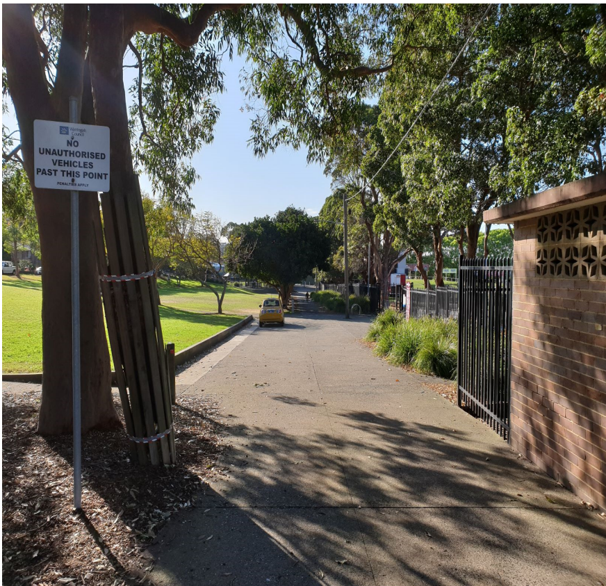
Fig. 2 Swept path drawing