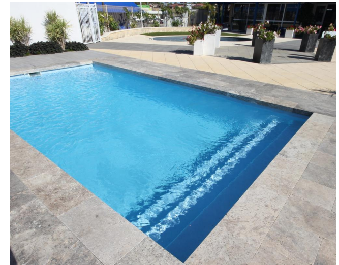
PAVED POOL SURROUND