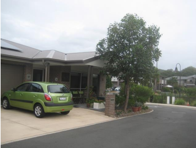
Tree No.23 [outside unit 97].