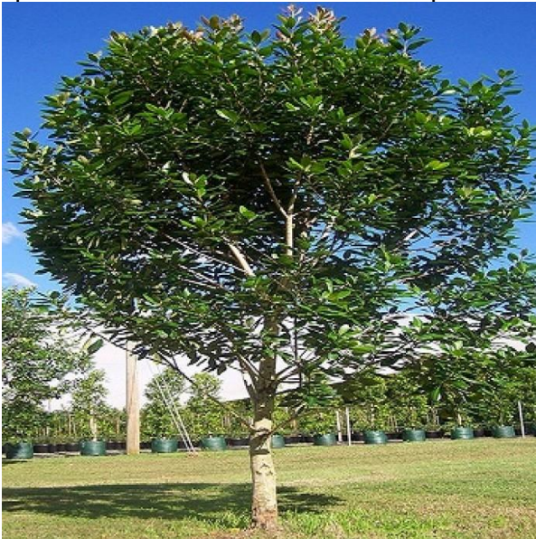
Water Gum: proposed replacement street tree species.

It is recommended that a smaller, less invasive tree species be introduced to the streetscape. Selected species: Tristaniopsis laurina 'Luscious' [Water Gum]. 75 litre size container. This species has the advantage of being easily trimmed to provide clear sight-lines under its canopy, whilst still retaining its natural uniform [elongated spheroid] shape. The approximate upper-end mature size of 8 metres tall x 4 metres spread will fit a lot more appropriately into the spaces at Glasshouse Circuit. This species is readily available at Sydney metropolitan nurseries.