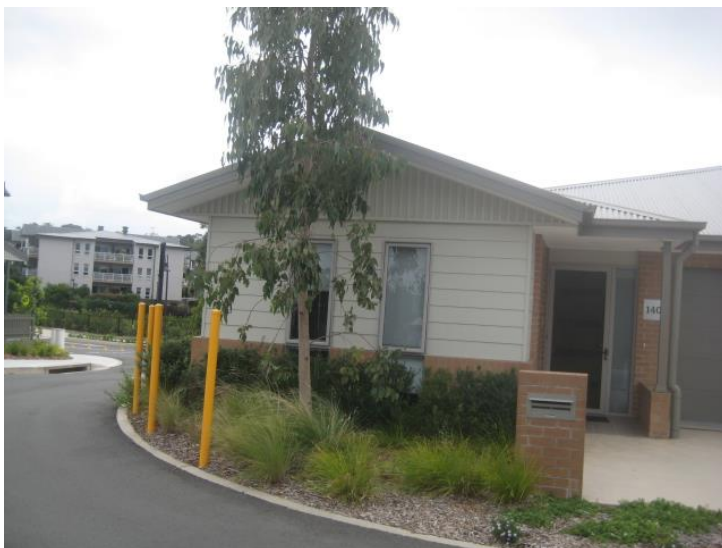
Tree No.1 [outside unit 140].