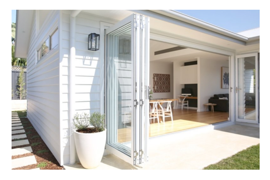
New Metal Roof, Gutters and Downpipes to rear North Elevation - Colorbond Basalt or similar