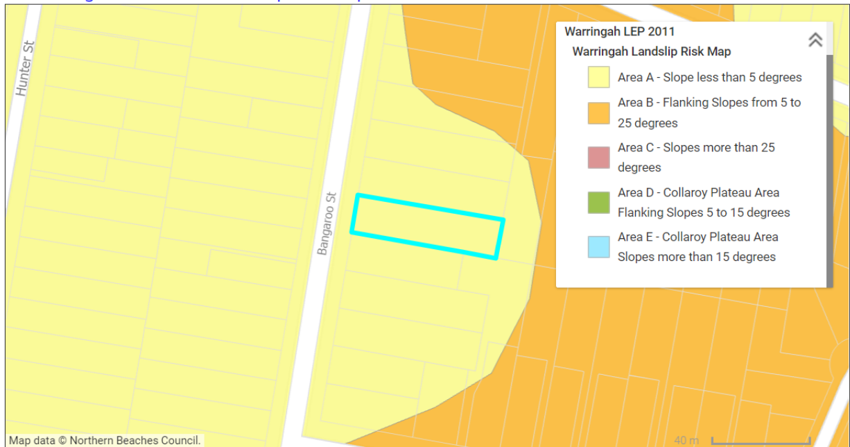
Figure 1: Land slip risk map for 49 Bangaroo St, North Balgowlah (site location marked in red), in Area "A".

The development will not cause detrimental impacts because of stormwater discharge from the land and will not cause detrimental impact on the existing subsurface flow conditions including those of other properties.