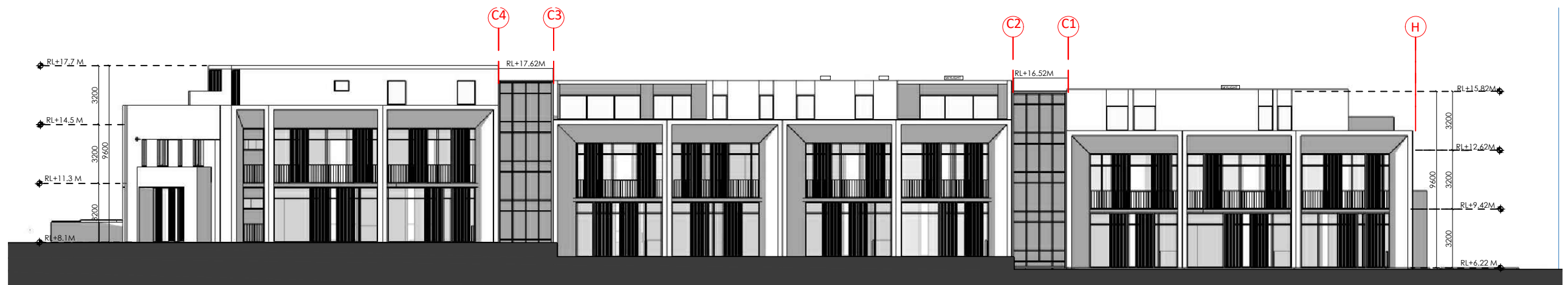
NORTH- WEST ELEVATION BLOCK C