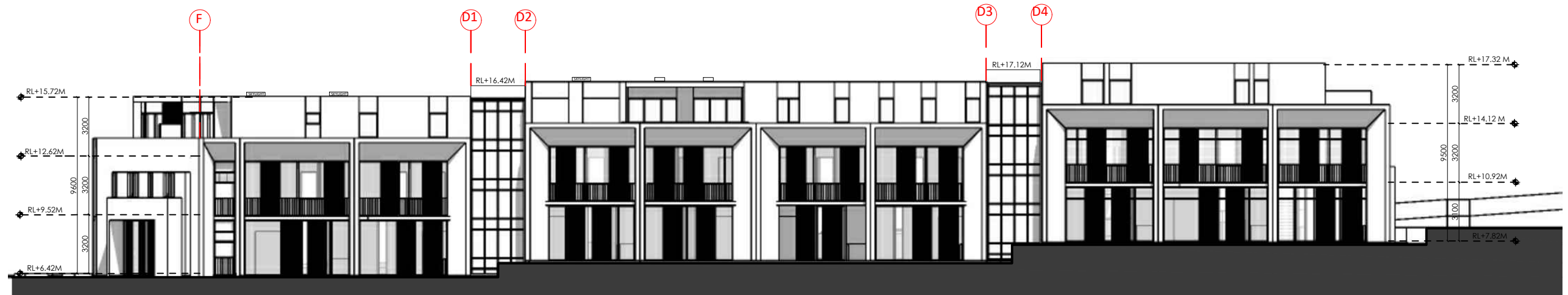
SOUTH- EAST ELEVATION BLOCK D