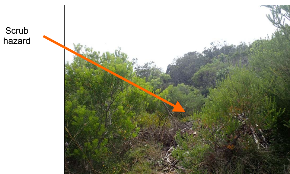
Photograph 03: View into the vegetation posing a hazard to the subject site