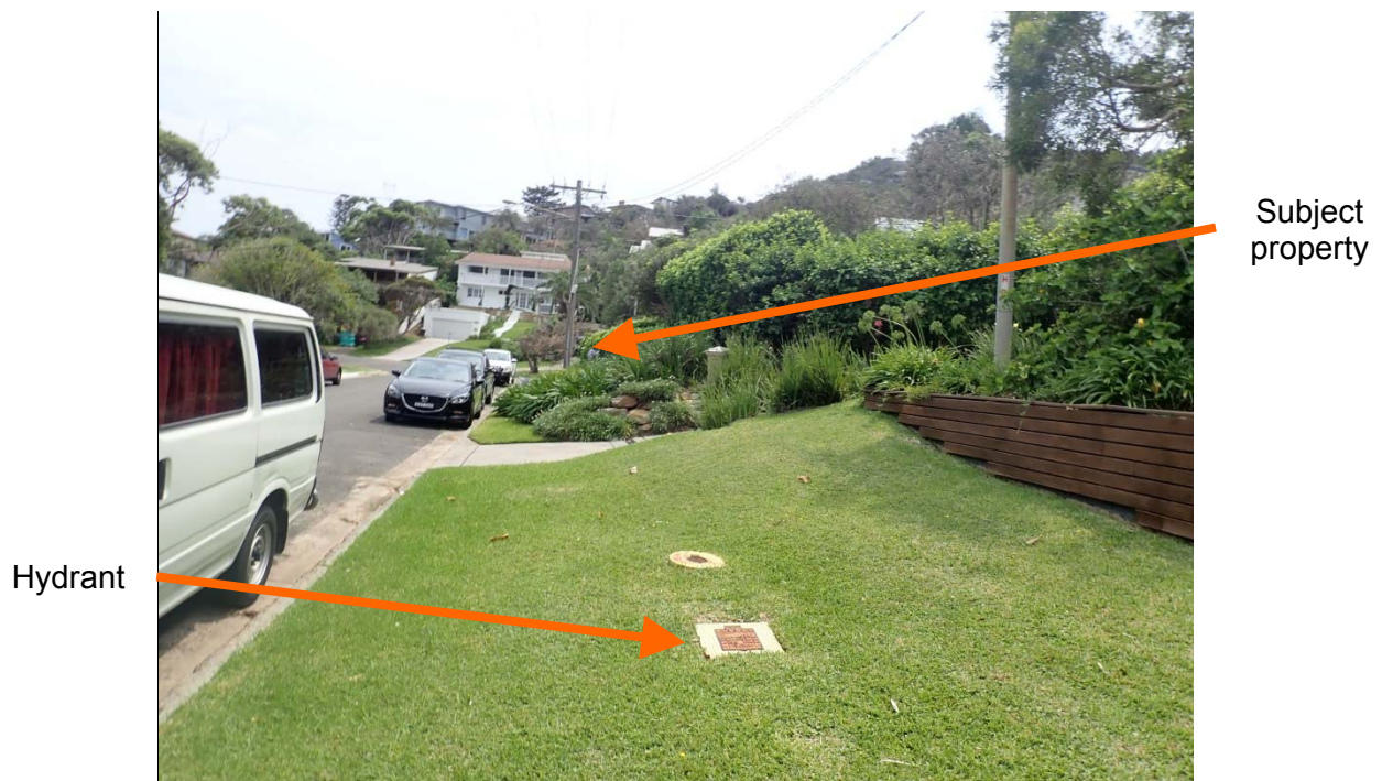
Photograph 06: View north from an existing hydrant toward the subject property

The existing water supply is considered adequate for the replenishment of attending fire services.