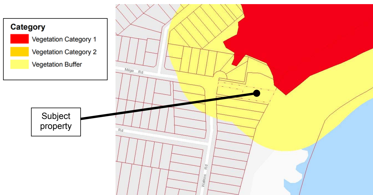
Image 02: Extract from NSW Planning Portal of Northern Beaches Councils Bushfire Prone Land Map

The subject development relates to the alterations and additions to an existing sole occupancy dwelling within an existing residential allotment. To accord with PBP the development is classified as infill development and assessed as a s4.14 application under the Environmental Planning and Assessment Act 1979.