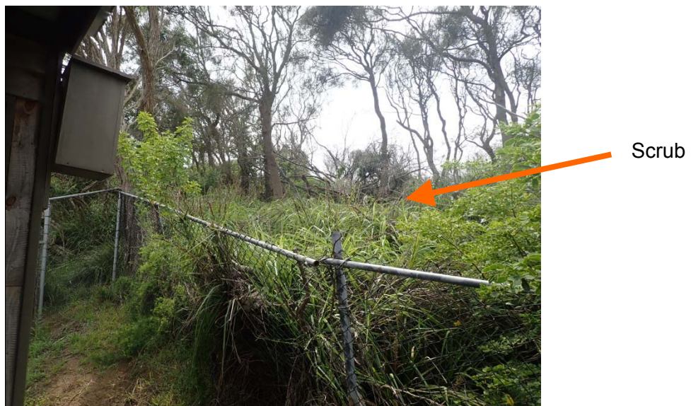
Photograph 02: View into the vegetation posing a hazard to the subject site

For the purpose of this assessment the vegetation posing a hazard to the subject property has been determined to be the Scrub.