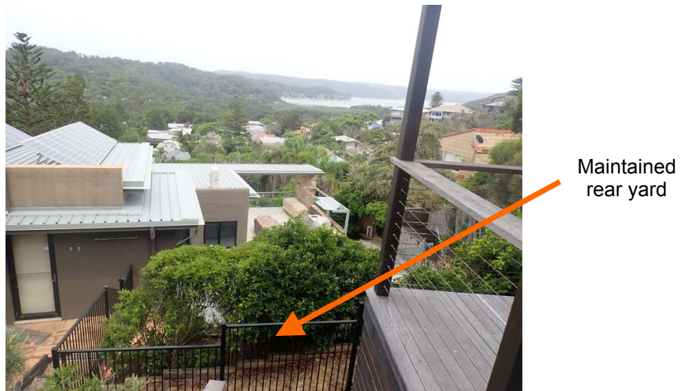
Photograph 04: View west across the maintained rear yard of the subject property

All grounds within the subject property not built upon will be maintained as an Asset Protection Zone (Inner Protection Area) as detailed in the NSW Rural Fire Service’s document ‘Standards for Asset Protection Zones’. Note: This will allow for gardens (including native trees and shrubs) in the APZ managed as clumps or islands, covering no more than 20% of the area.