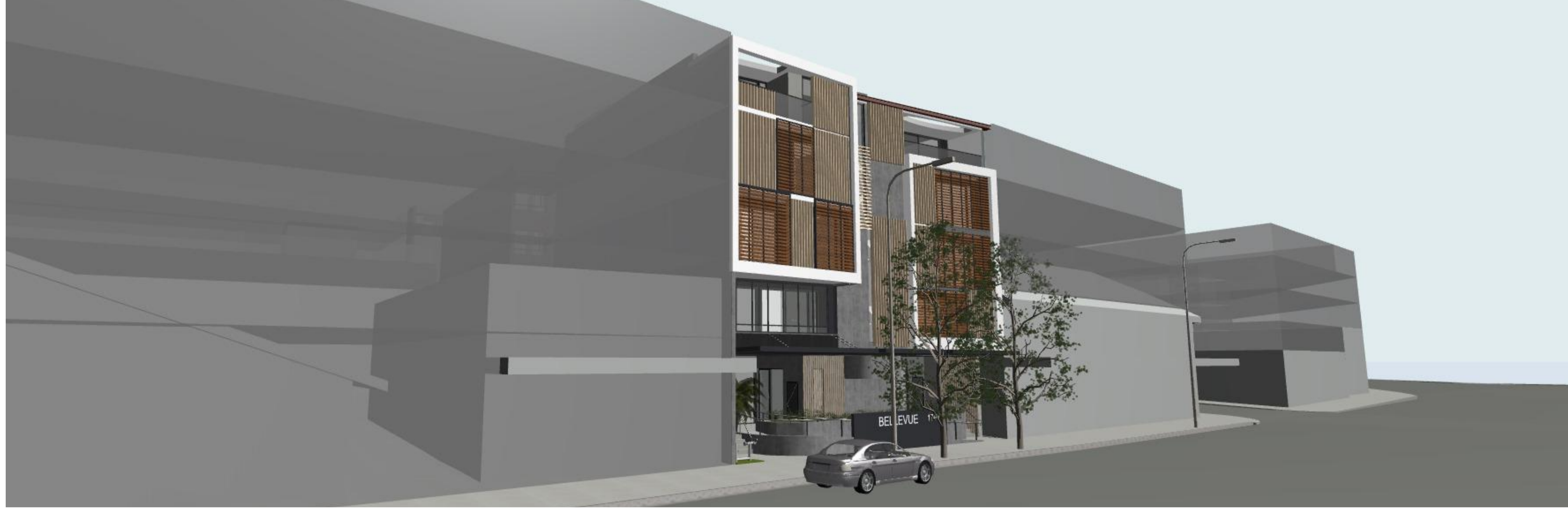
CONTEXT VIEW 4