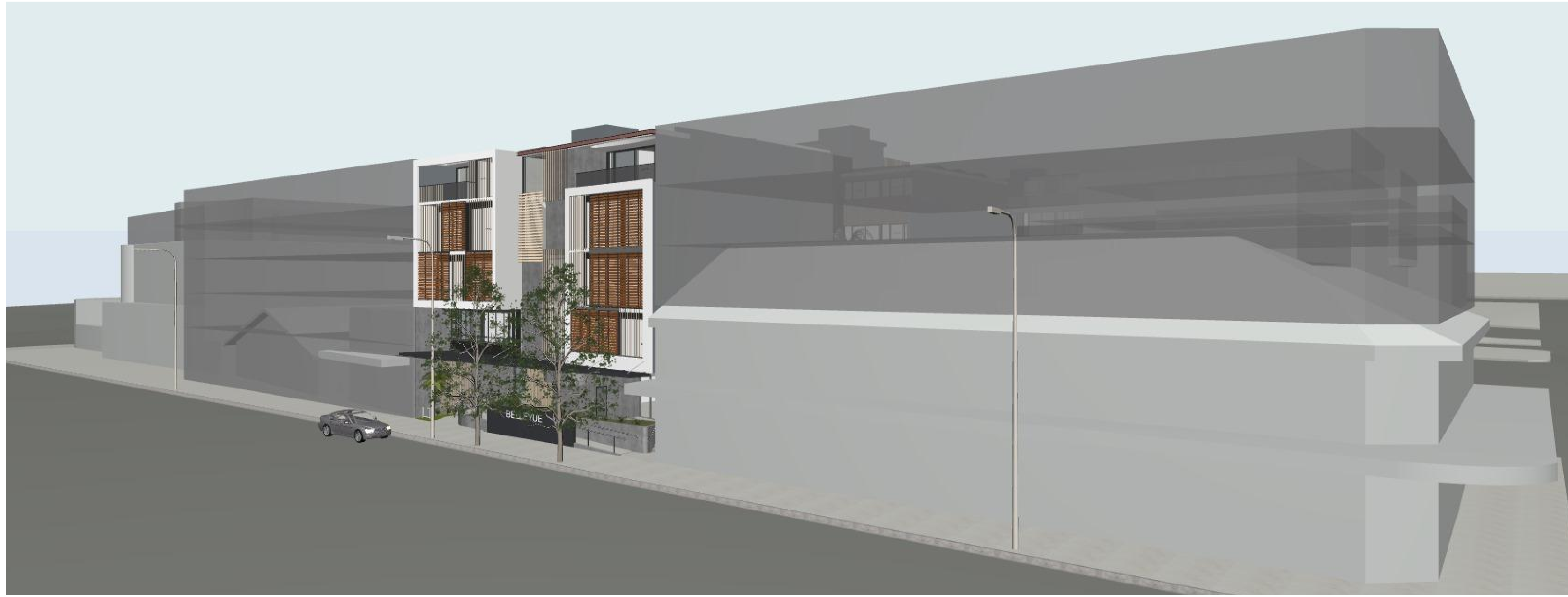
CONTEXT VIEW 1