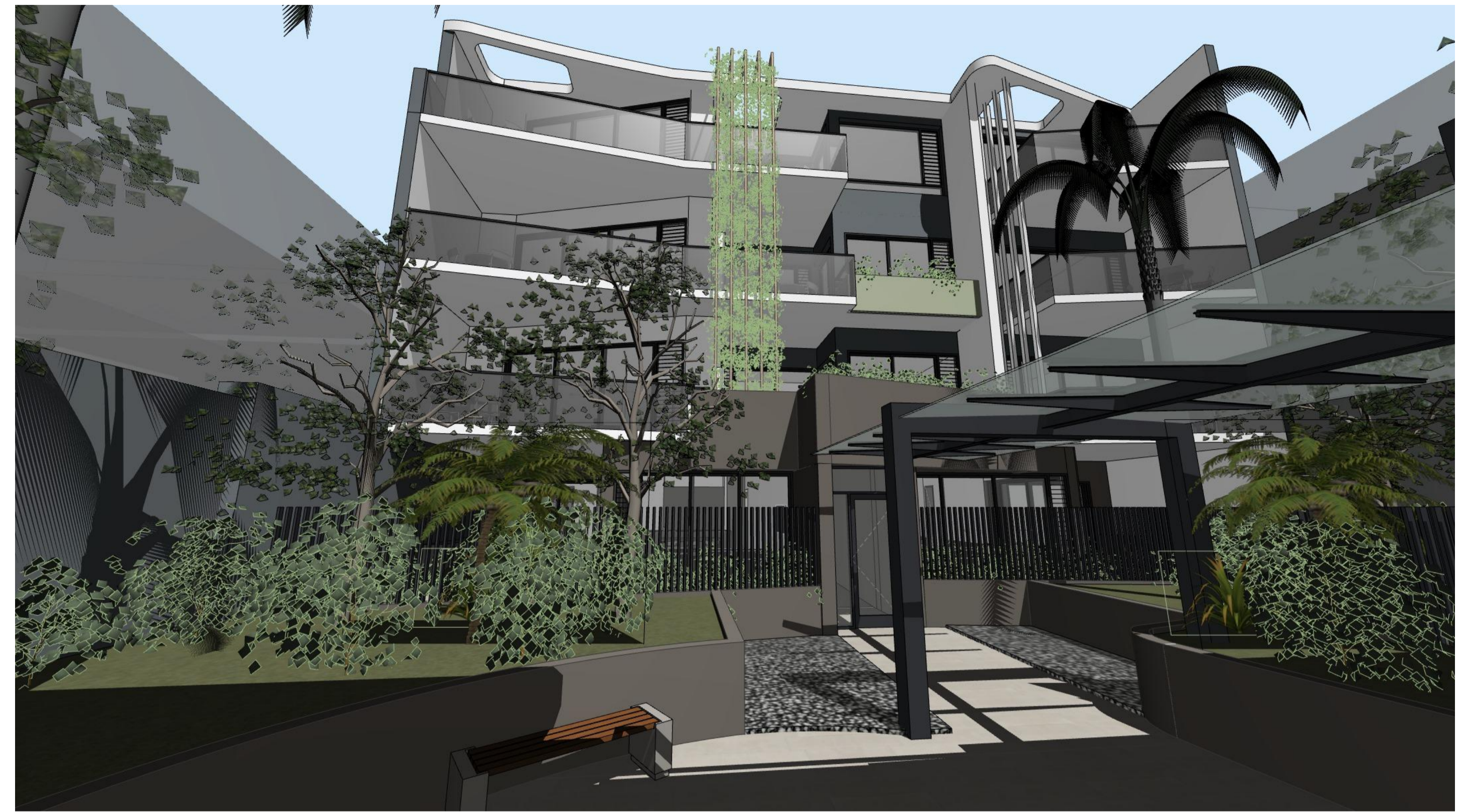
COURTYARD VIEW (REFER SECTION C)