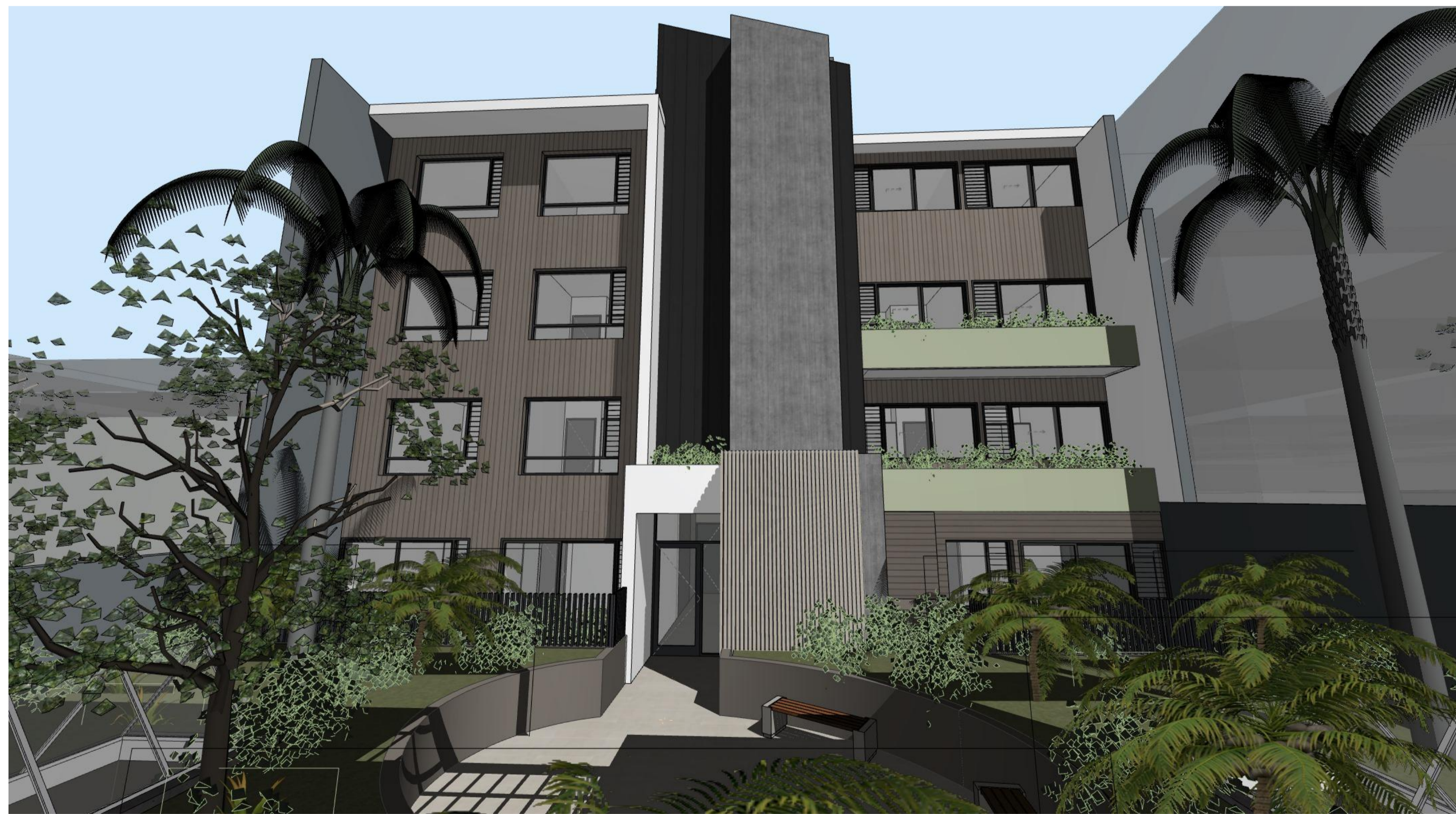
COURTYARD VIEW (REFER SECTION D)