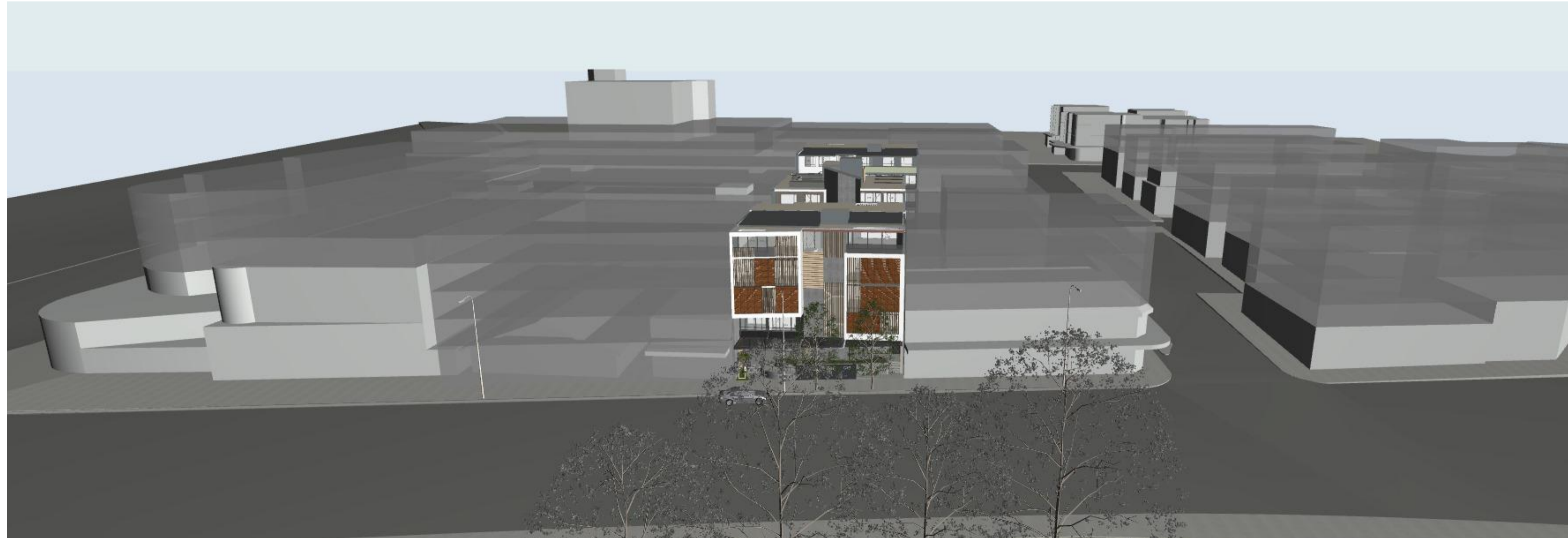
CONTEXT VIEW 5