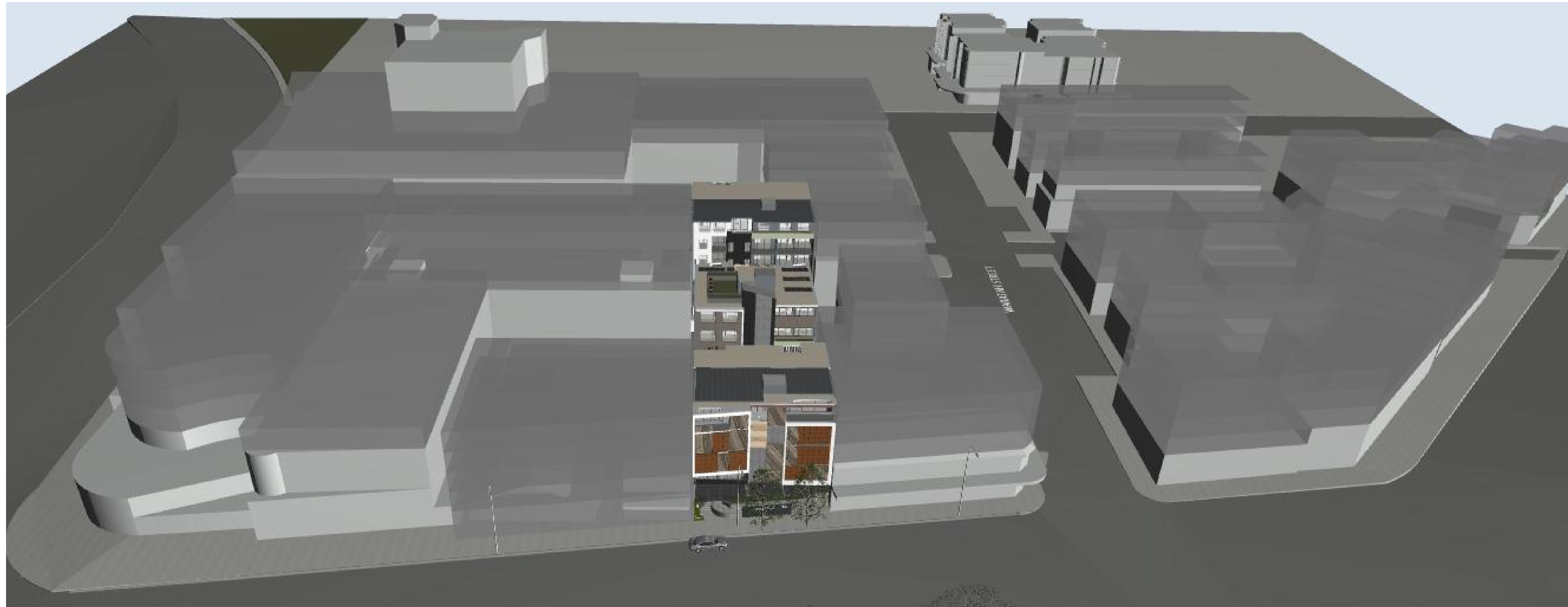
CONTEXT VIEW 2