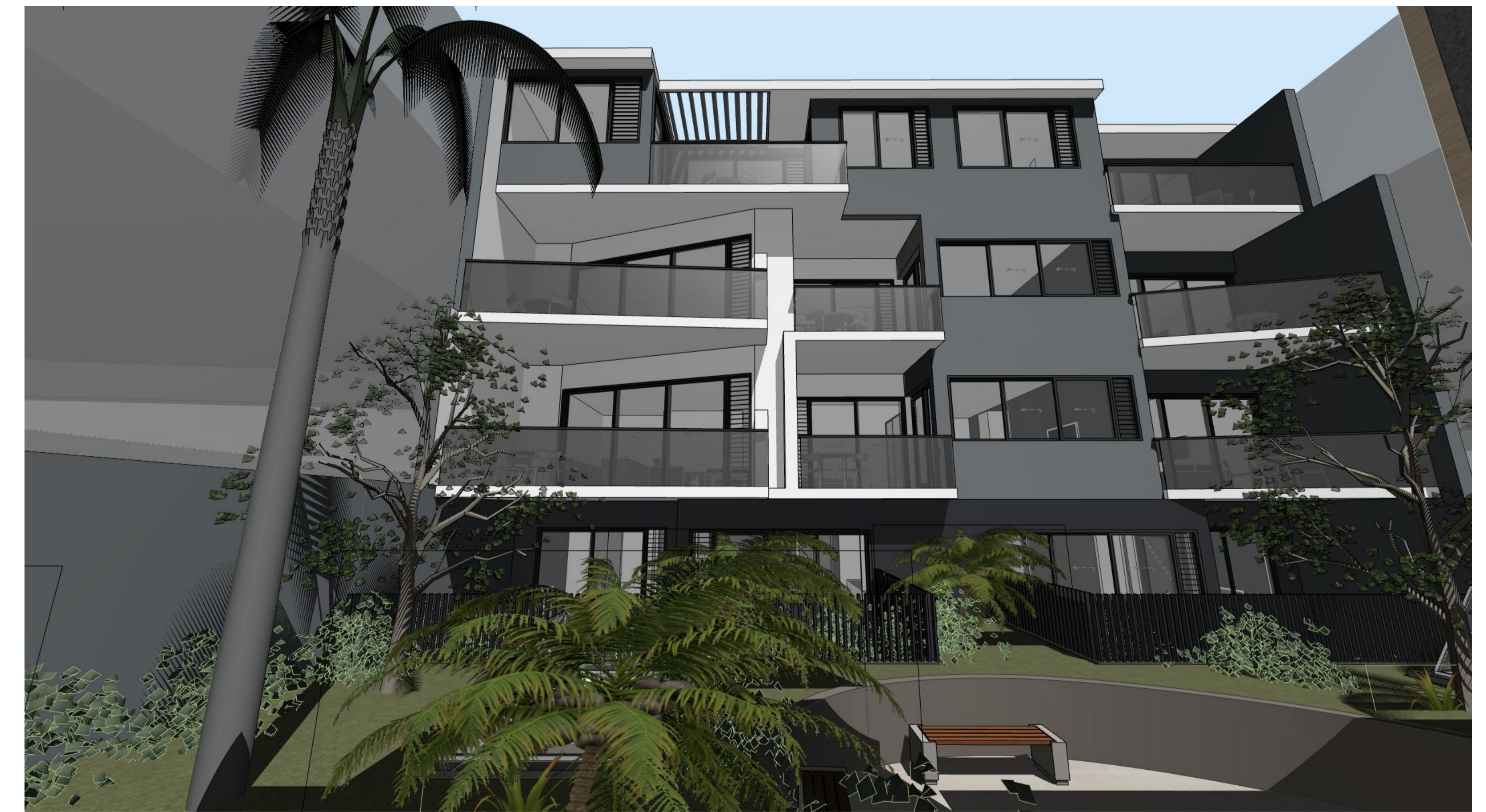
COURTYARD VIEW (REFER SECTION E)