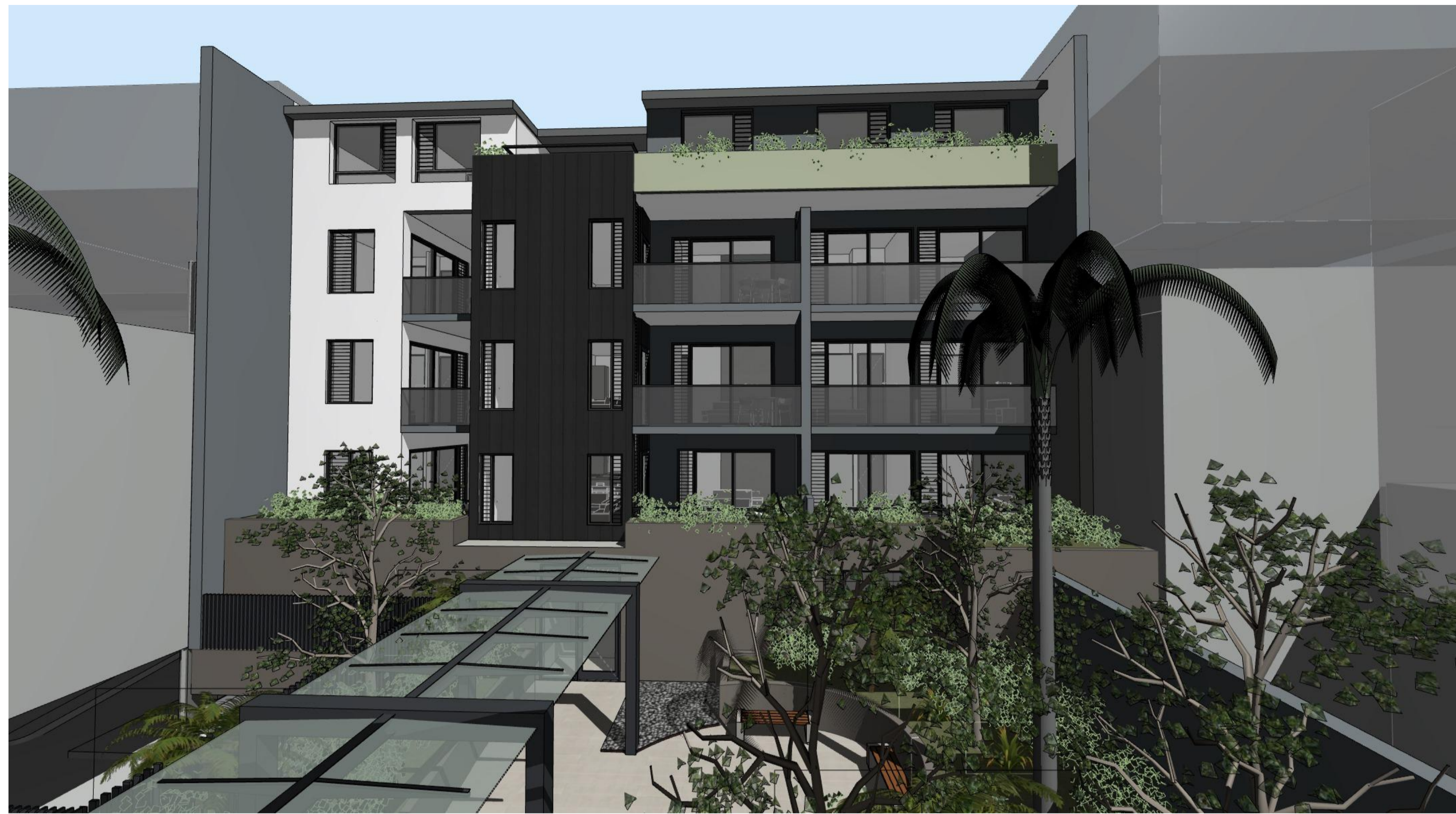
COURTYARD VIEW (REFER SECTION B)