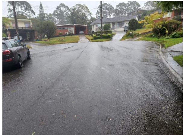
Cullen Street, looking North West