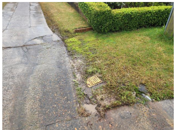
Reticulated water hydrant in pathway