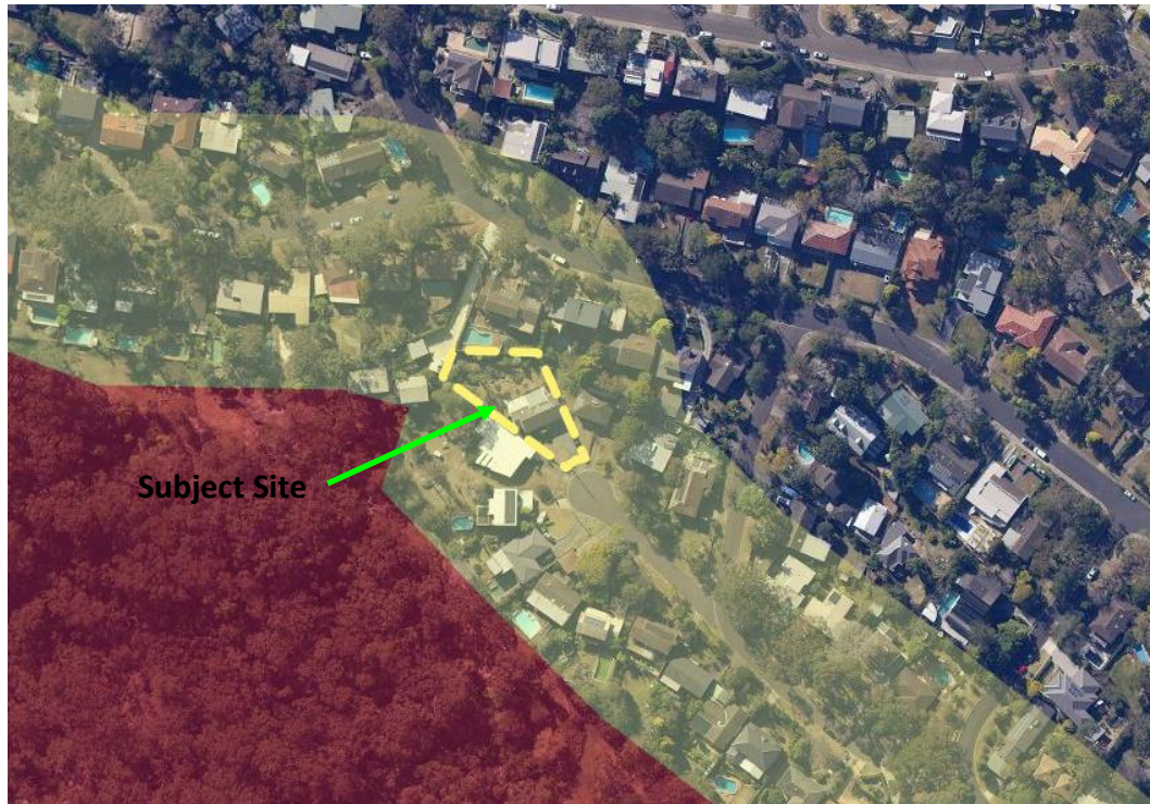
Extract Northern Beaches Council LGA Bushfire Prone Land Map