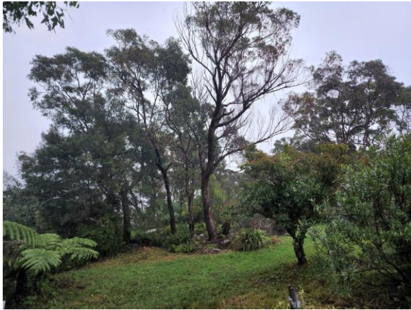
Bushfire vegetation, within reserve beyond adjacent residential development, looking South East