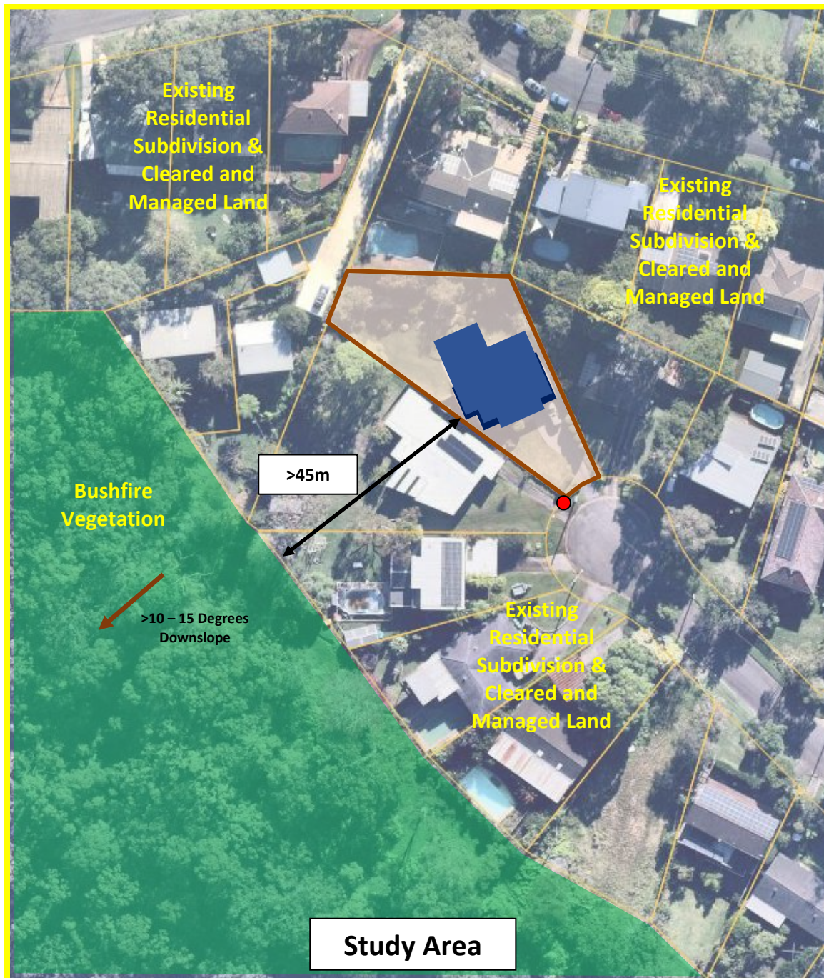
Map 1 – Study Area / Subject Lot / Slopes / APZ extent