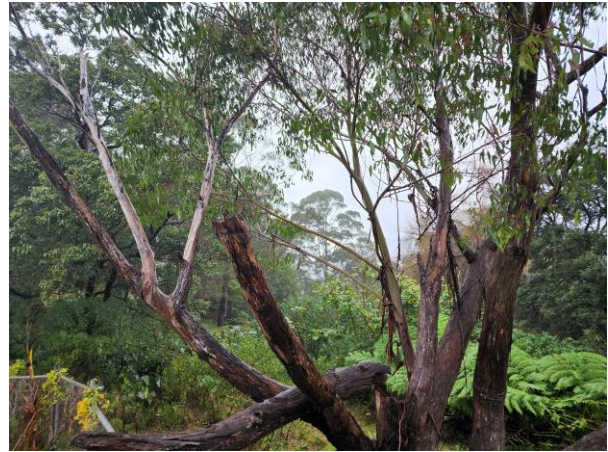
Bushfire vegetation, within reserve beyond adjacent residential development, looking North West