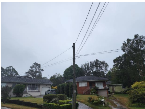
Above ground electrical supply