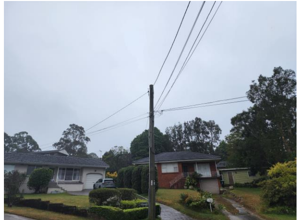
Existing access/driveway, looking North