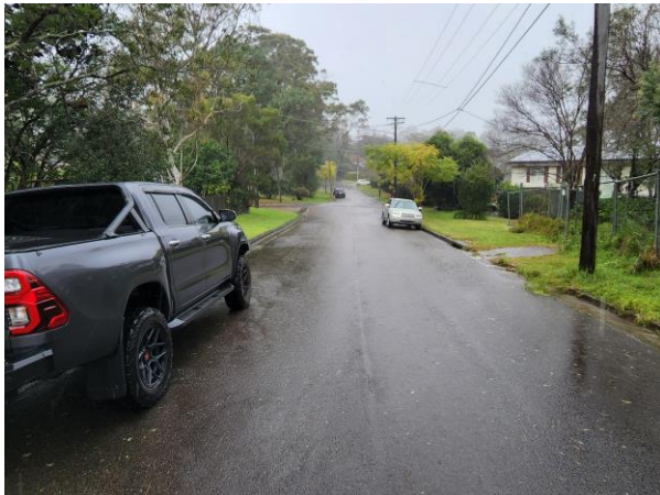
Cullen Street, looking South East