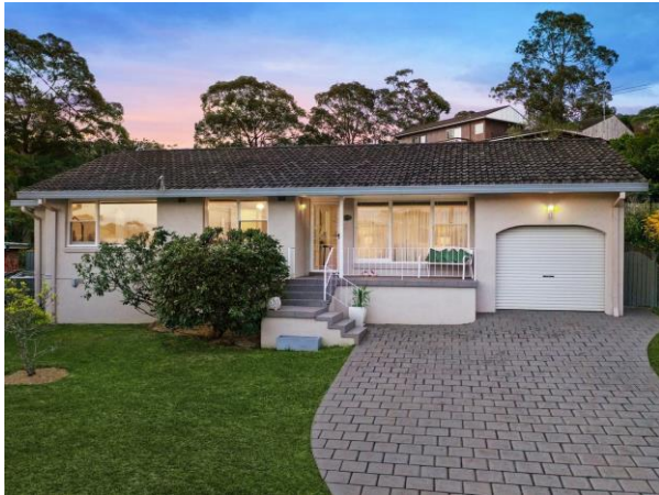
Subject site, looking North West