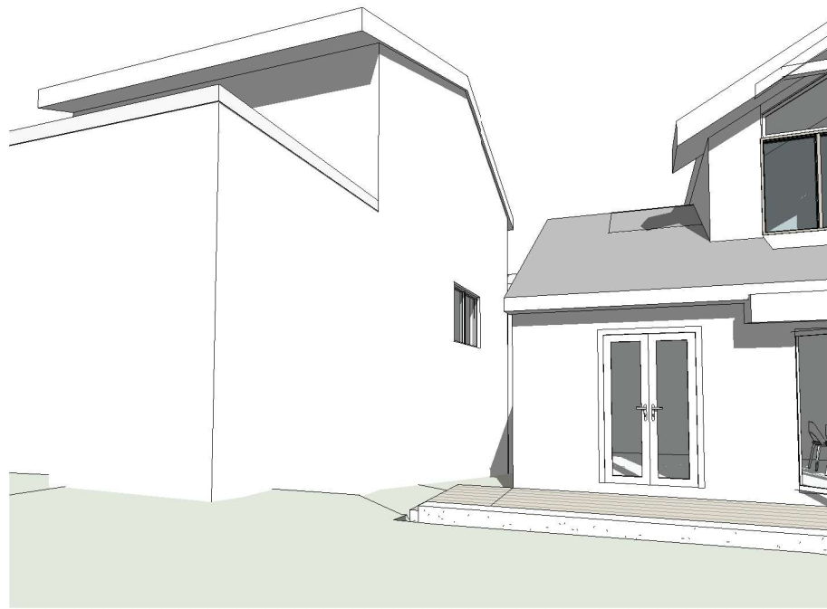
1 | 1pm June existing