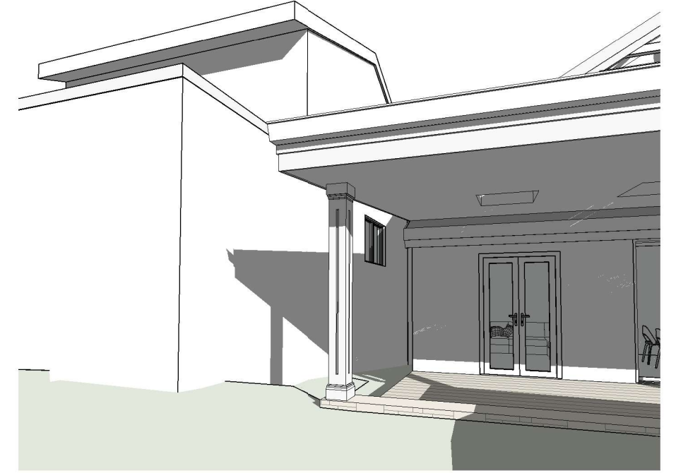
6 | 3pm June proposed