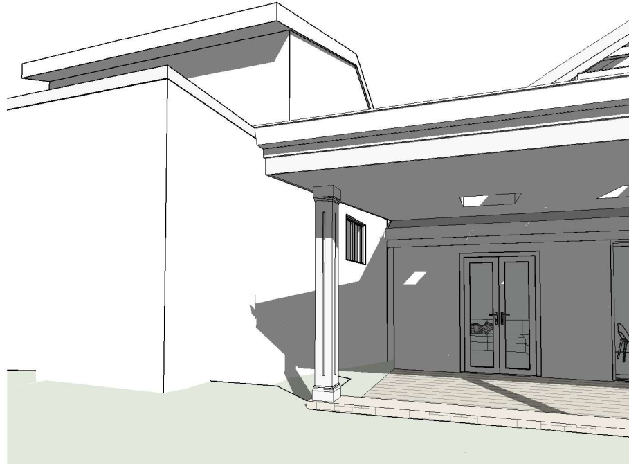
4 | 2pm June proposed