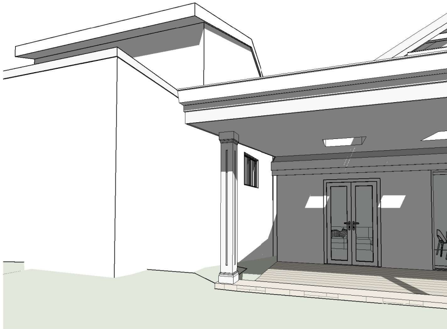
2 | 1pm June proposed