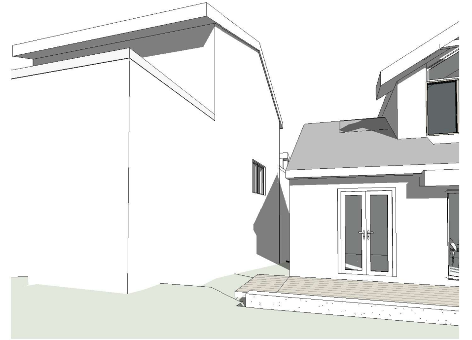
5 | 3pm June existing