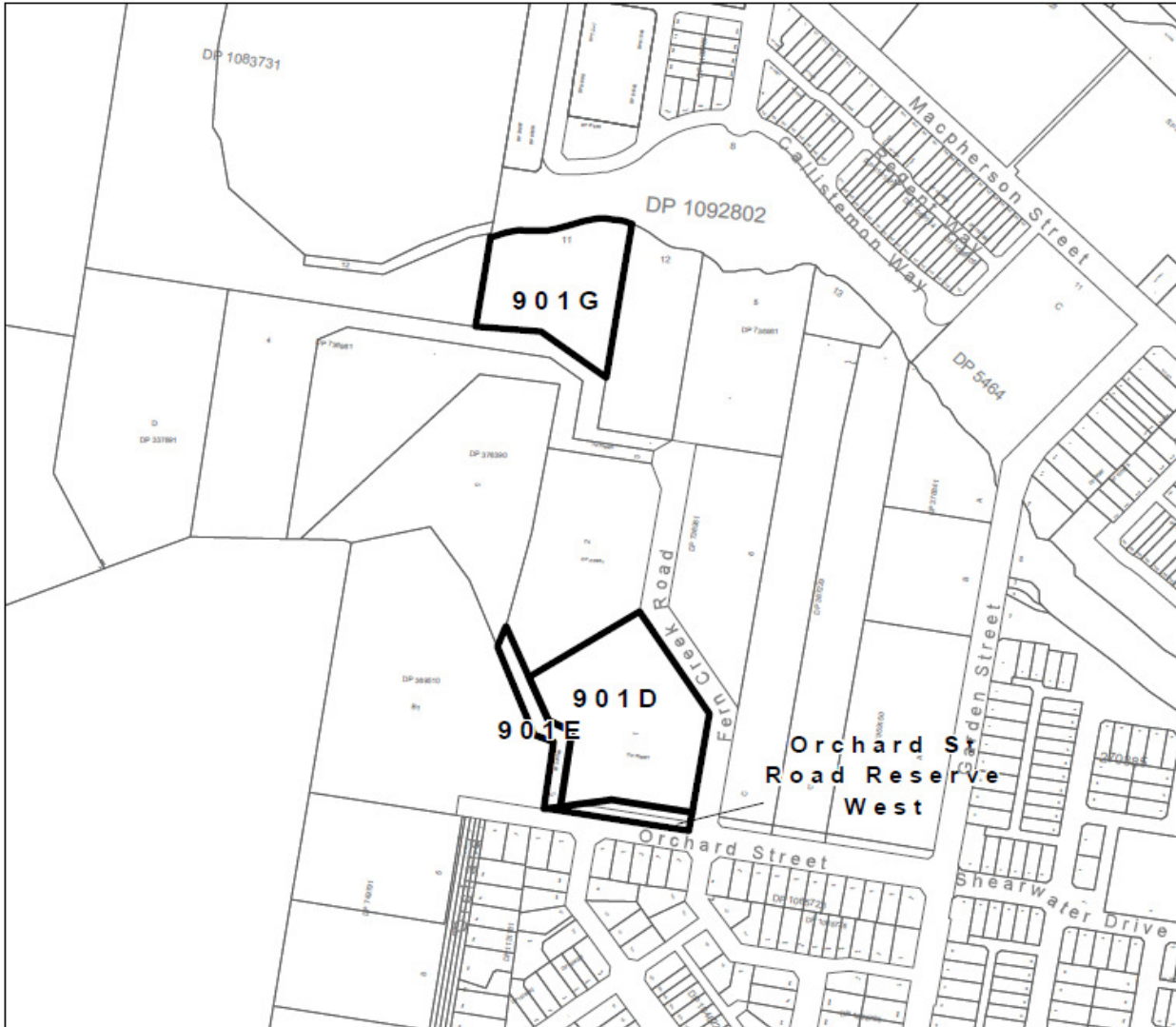
Map 5: Pittwater Local Environmental Plan Sheet 3