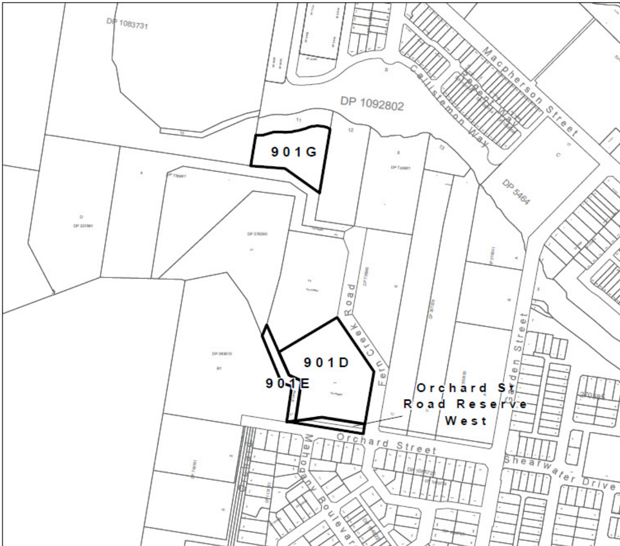
Map 4: Pittwater Local Environmental Plan Sheet 2