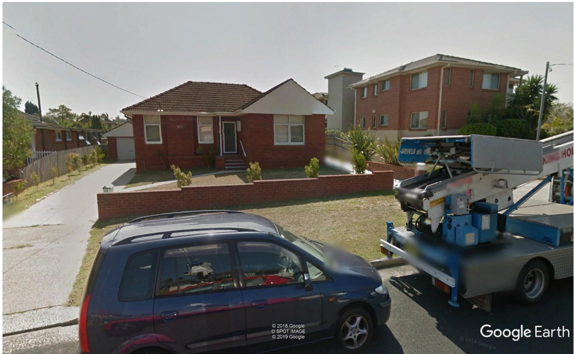
Adjoining northern property

This adjoining dwelling maintains a generous setback from the subject site and has its outlook directed towards the street and rear yard. The proposed upper level addition has been kept well distant from the common boundary maximising the separation between built form.