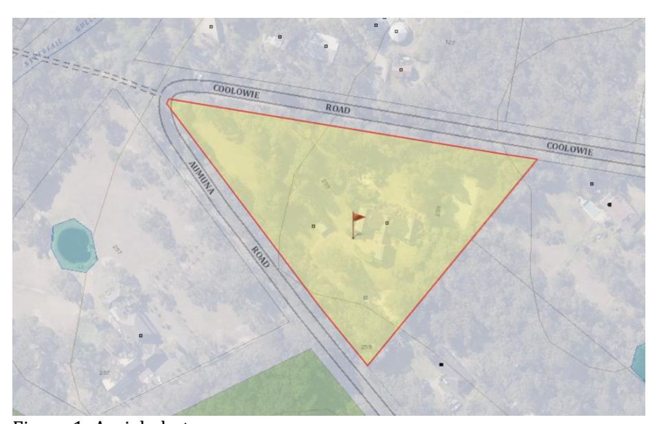
Figure 1: Aerial photo

The proposed development is an infill development as defined within chapter 7 of Planning for Bushfire Protection 2019 and this report has been prepared in accordance with the requirements of Section 4.14 of the Environment Planning and Assessment Act.