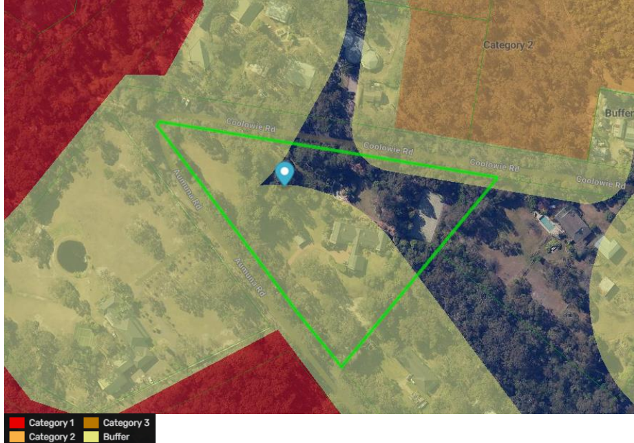
Figure 2: Bushfire prone land map