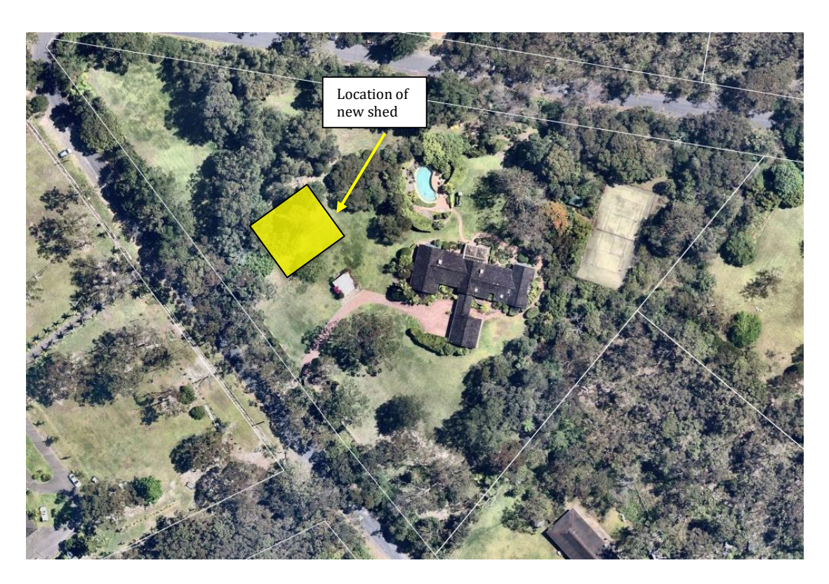
Figure 4: Aerial photo showing the location of the new shed and distance to surrounding residential dwellings.

In this instance, the proposed new shed is greater than 6m from all surrounding residential dwelling, as such, there are no bushfire specific protection requirements.