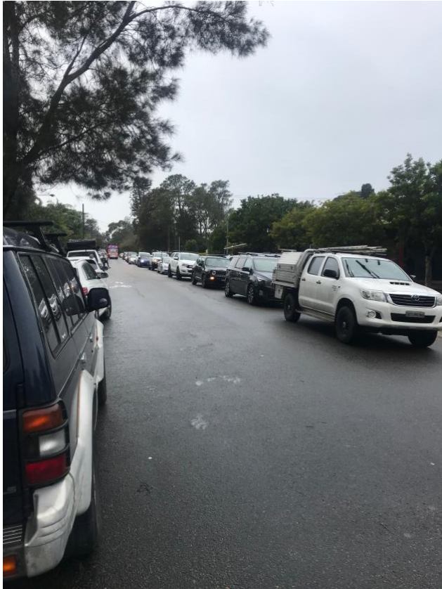
Attachment C – Images showing morning traffic congestion on North Avalon Road (top) and narrow pathway to bus stop on western side of Barrenjoey Road (bottom).