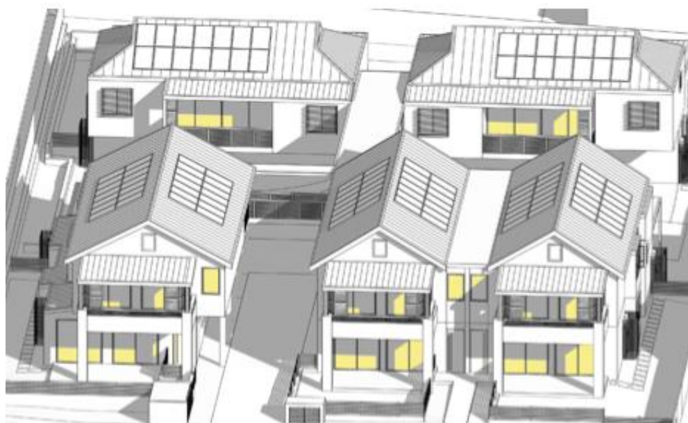
3D image from the Shadow Diagrams report looking south, illustrating the inappropriate bulk and scale of the development.