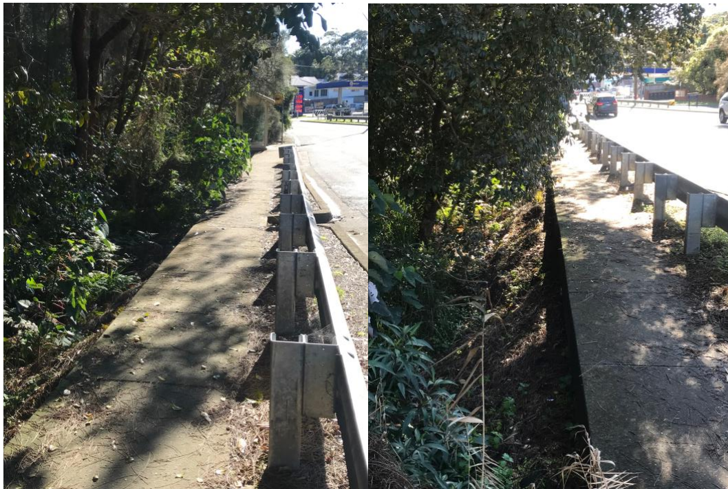
Pathway on the western side of Barrenjoey Road between the return bus stop and the Barrenjoey Road crossing. The path is less than 1200 mm wide in places and there is a steep 1-2 metre drop on the edge of the pathway.