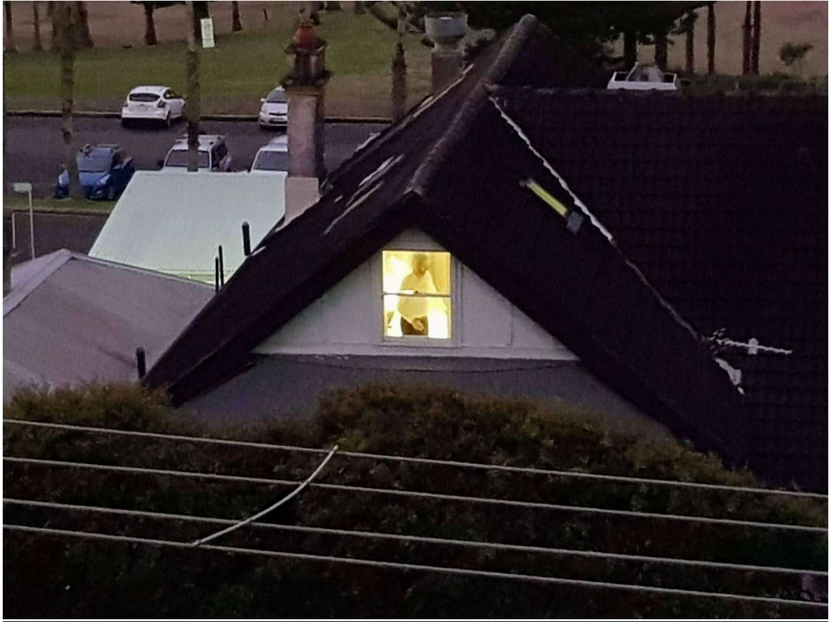
UNAUTHORISED CONVERSION OF ATTIC IS A FIRE RISK