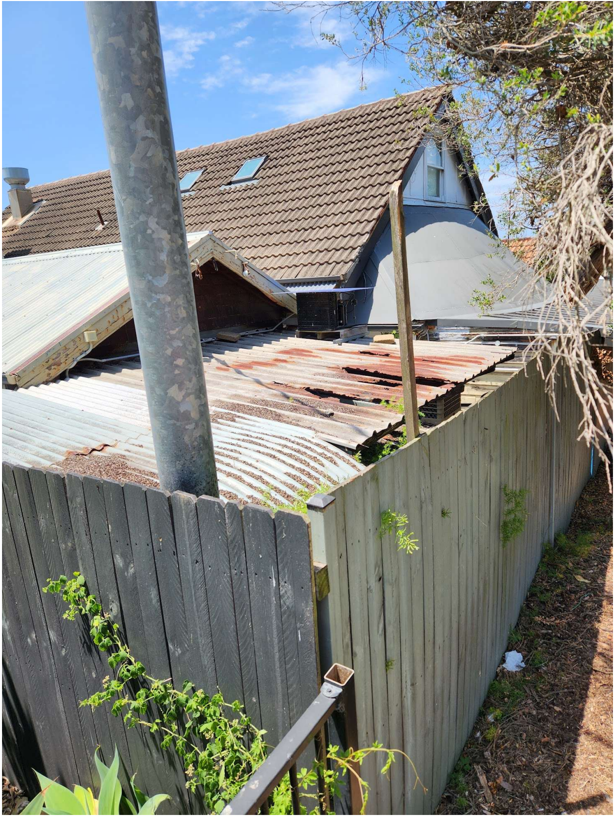
POOR MAINTENANCE OF FRESHWATER'S MOST HISTORIC BUILDING