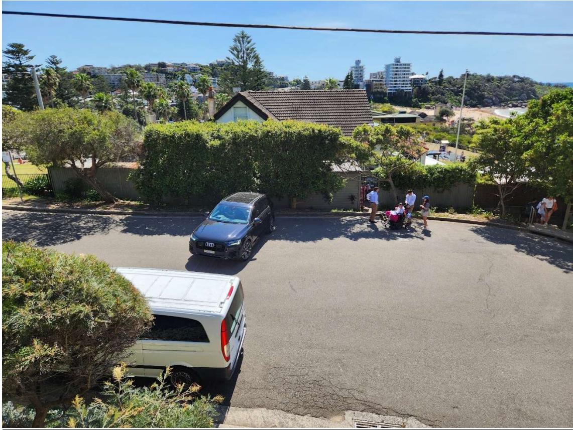
UNAUTHORISED AND USAFE USE OF GATE TO UNDERCLIFF ROAD