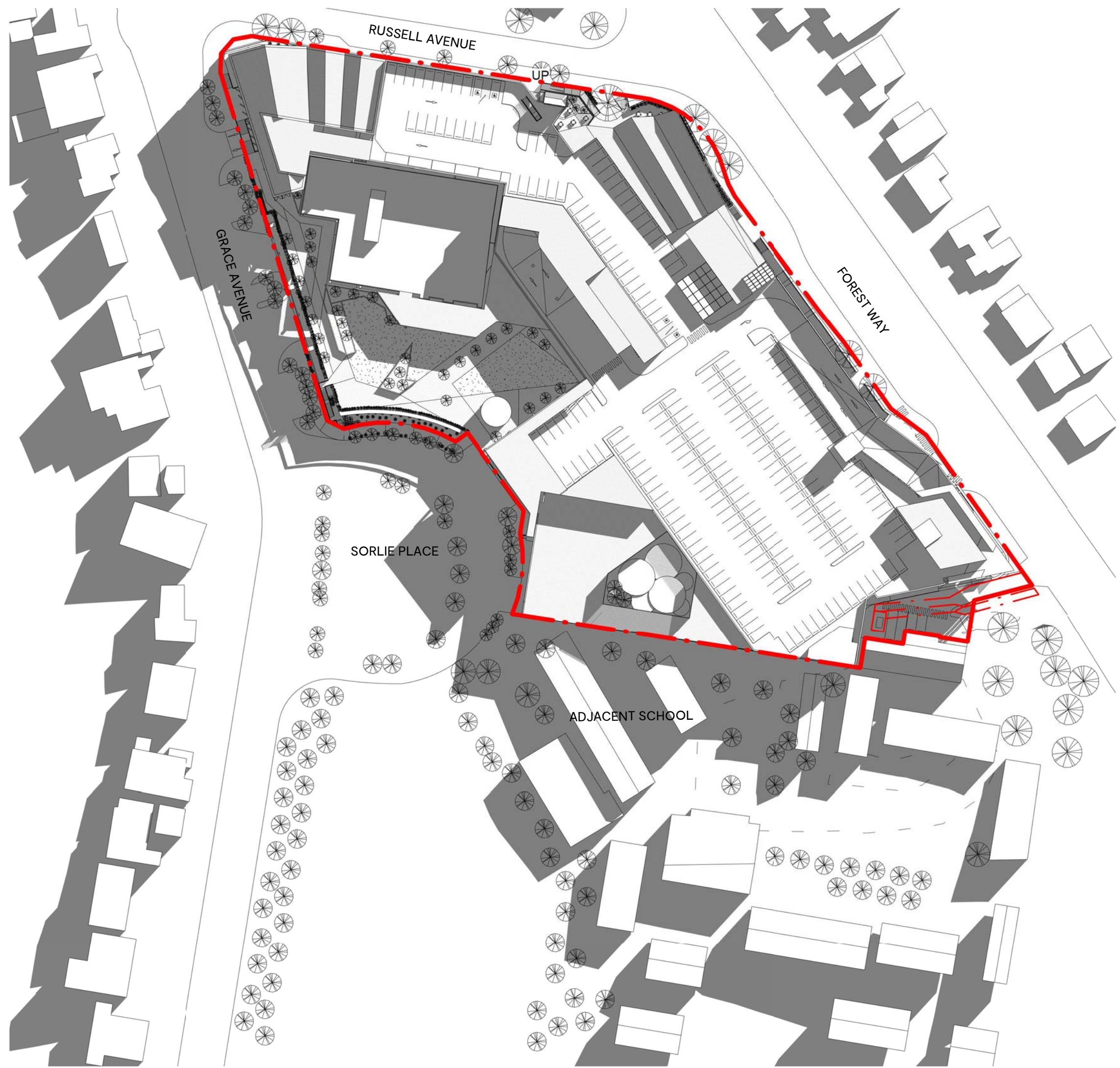
21st JUNE 10AM SCALE 1:1000