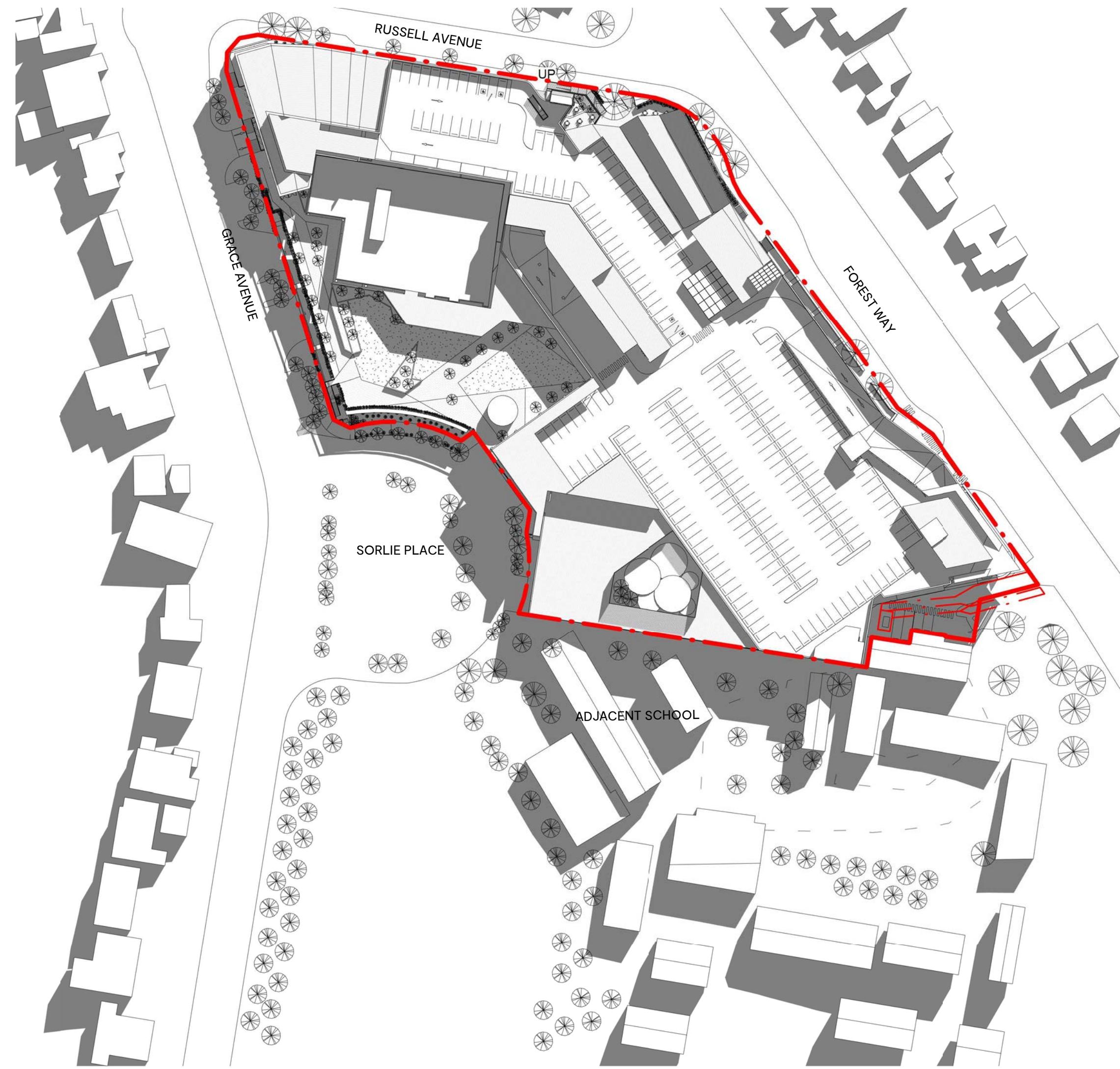
21st JUNE 11AM SCALE 1:1000