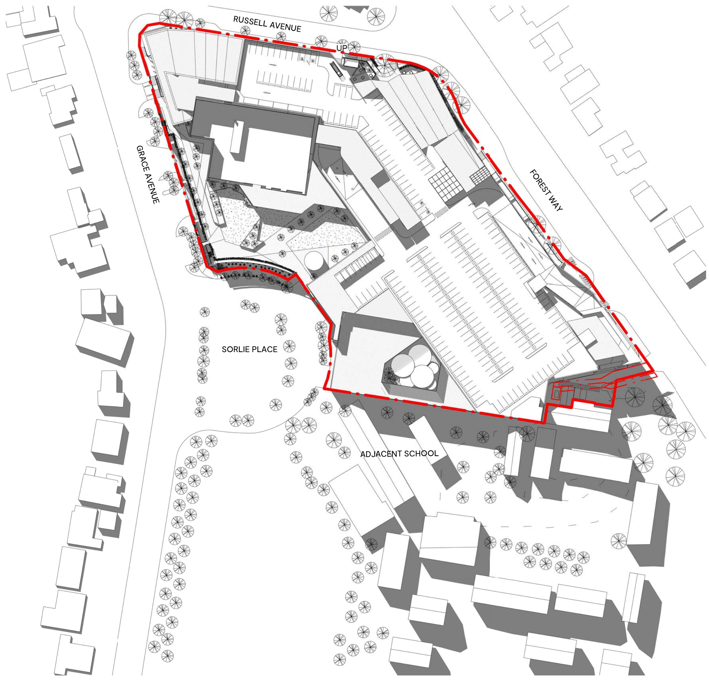
21st JUNE 3PM SCALE 1:1000