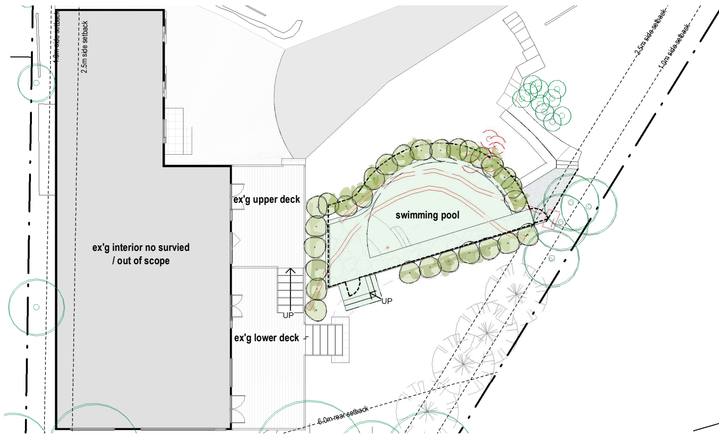
1 Pool Level 1 : 200